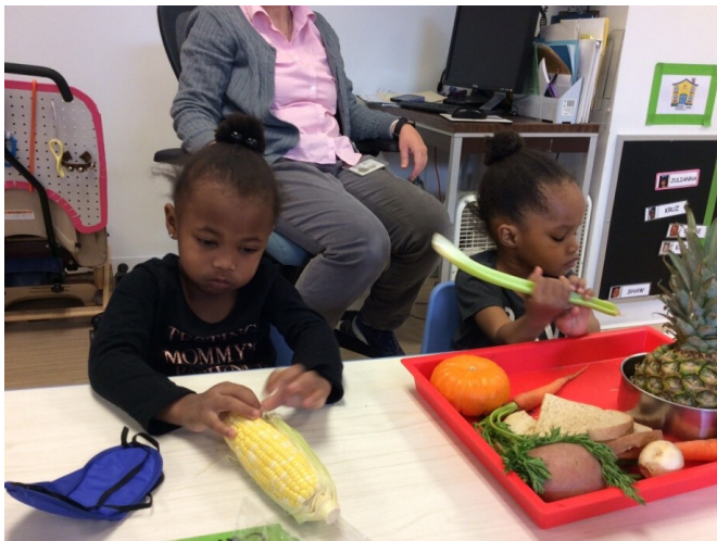
Students explore and learn about vegetables including corn on the cob and celery