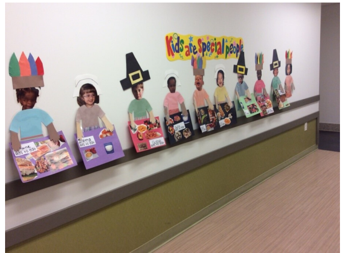
The hallway wall decorated with paper crafts of pilgrims and Indians with pictures of each student

-For more information or to register for these exciting events coming up at Highbrook Lodge, contact Jenny Schaeffer (x4596 or jschaeffer@clevelandsightcenter.org ):