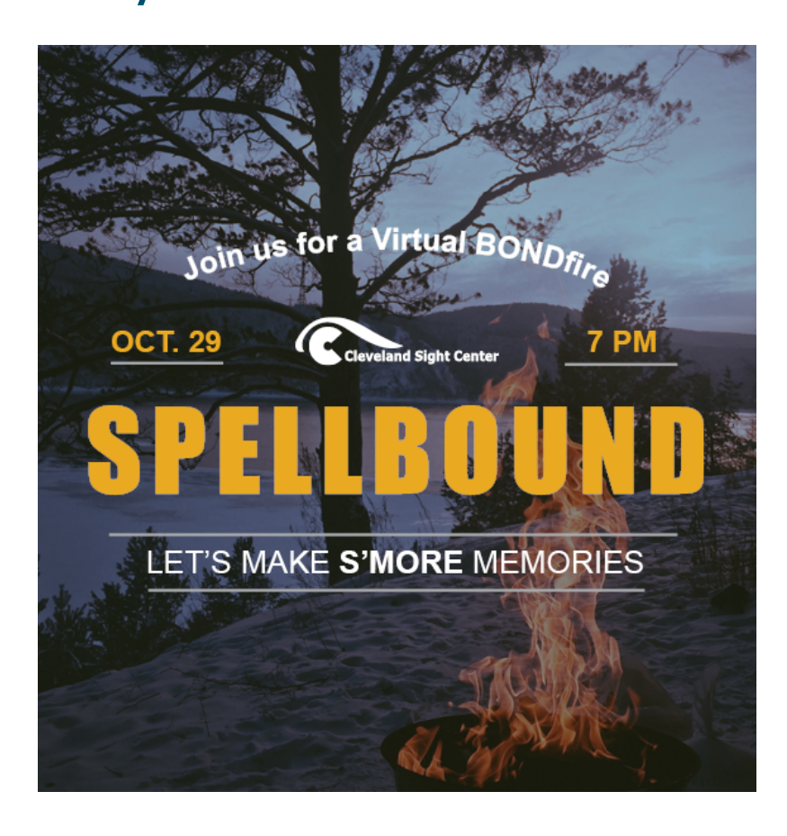
Image of Spellbound 2020 with a campfire on the beach next to a lake at sunset