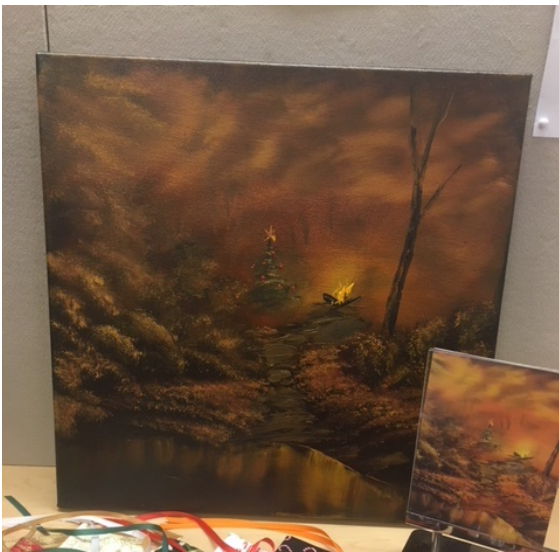
"Southern Holiday" by Brett Greer