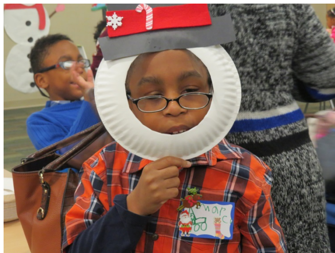
A construction paper fireplace flanked by trees Youngster holding his snowman face