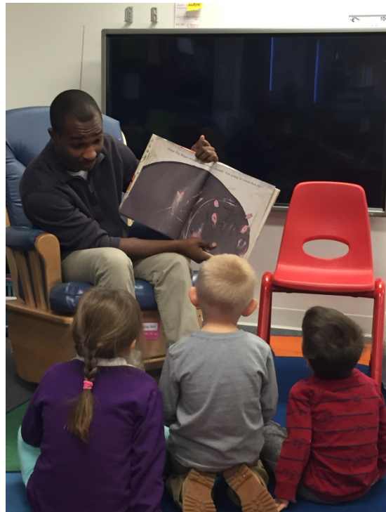
Preschoolers listening to the story