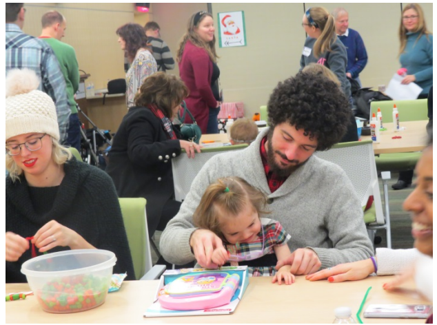
Youngster and her dad make a craft