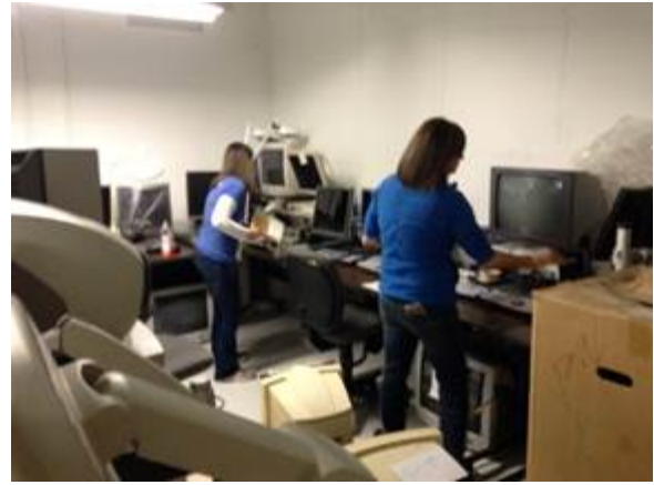
Volunteers clean equipment in CCTV room