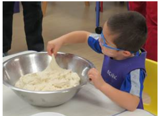
A preschooler touches a batch of dough