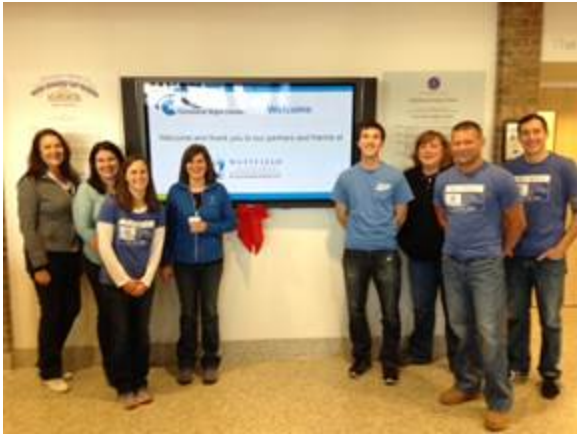
Westfield Group in front of lobby sign