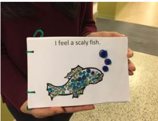
Close up of a scaly fish