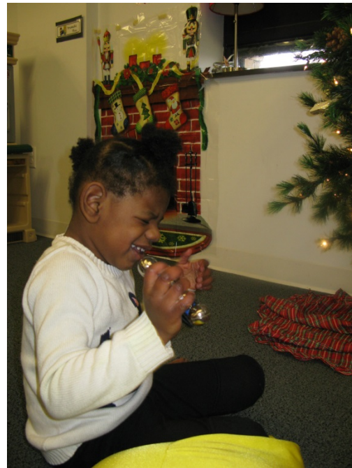
Youngster ringing the jingle bells