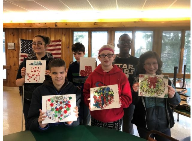
Campers display their art projects