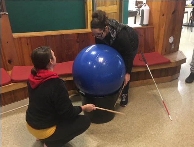
Camper tries cardio-drumming

attending on Friday, December 1 st and youth on Saturday, December 2 nd . Campers completed a holiday art project, took a hike (the weather was GREAT!), bowled, cardio-drummed, sang camp and holiday songs and more! Campers were already eagerly talking about summer 2018 – only 6 months away!