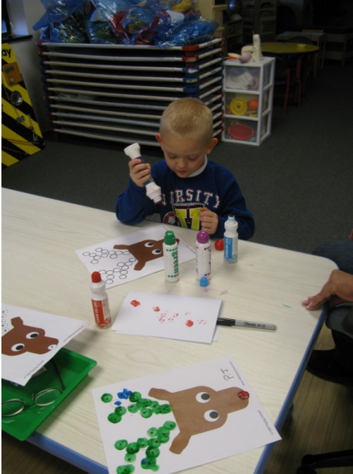
Preschooler making a craft