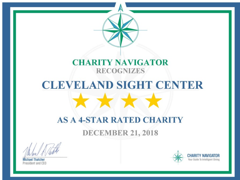
CSC's 4-Star Rating Certificate