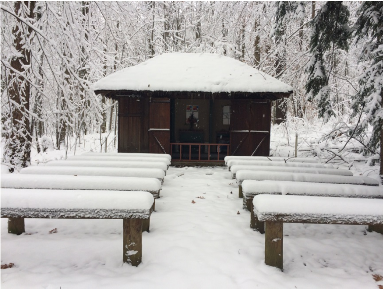
Snow covers benches at Highbrook Lodge