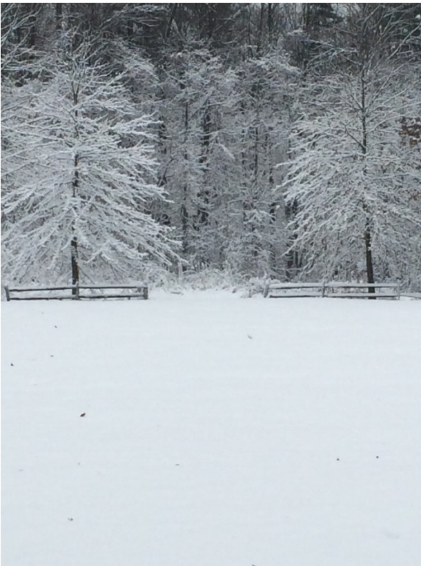
A snow-covered field with the woods in the background