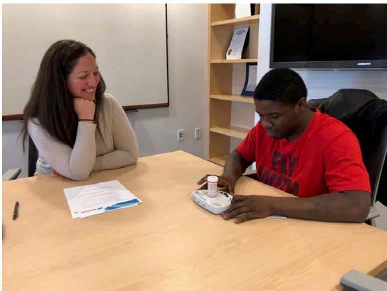
A user tests the ScripTalk machine while MetroHealth staffer observes