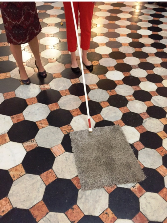
White cane demonstration on tile and carpet