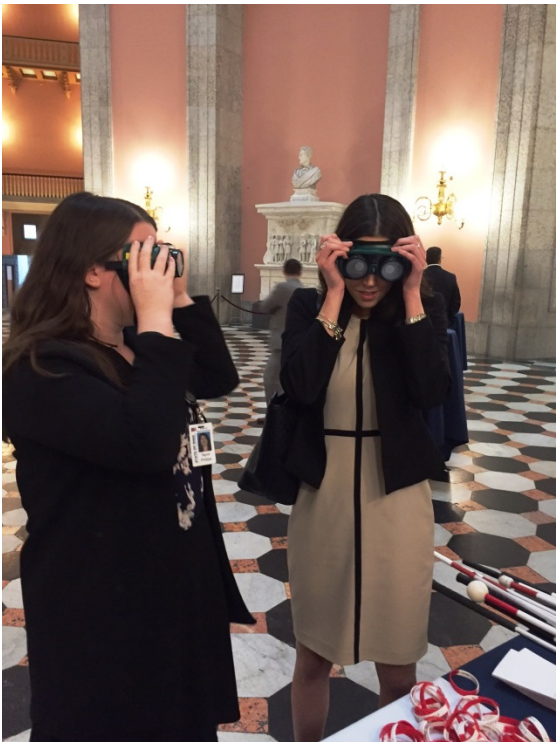
Visitors use vision simulation goggles