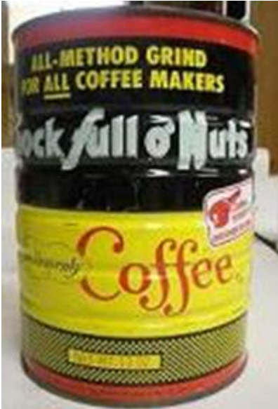
Image of Chock Full o' Nuts coffee can