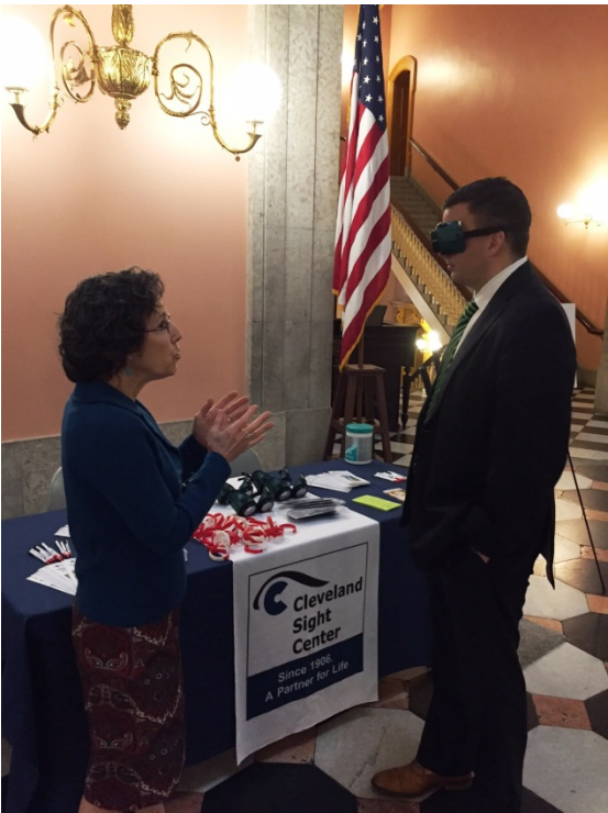
A visitor tries on vision simulation goggles