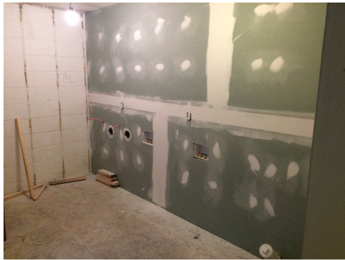
The new laundry room is ready for wall paint and the machines

The renovation work of Sears Hall at Highbrook Lodge continues as the basement is converted into a multipurpose space which will include a craft area, laundry facility, ADA-compliant restroom and staff lounge.