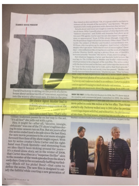
6-inch and 9-inch yellow bars on a magazine page

• This week's featured product: yellow bars. The Eyedea Shop has always carried the 2x magnifying bars in two sizes, 6-inch and 9-inch, and clear in color. But now the store offers this item in solid yellow. The yellow bar, for some people with low vision, will enhance the print off the page for easier reading. The price for the 6-inch yellow bar is $9.50 and the 9-inch yellow bar is $13.50. Come check them out!