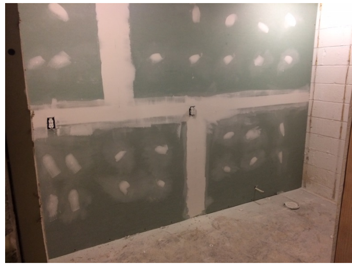
The new ADA-compliant bathroom is prepped for wall paint and bathroom fixtures