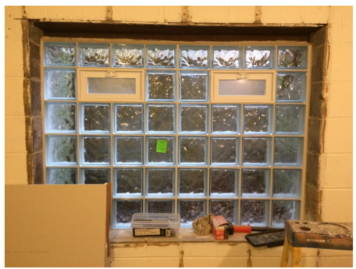
New glass block windows in the basement of Sears Hall