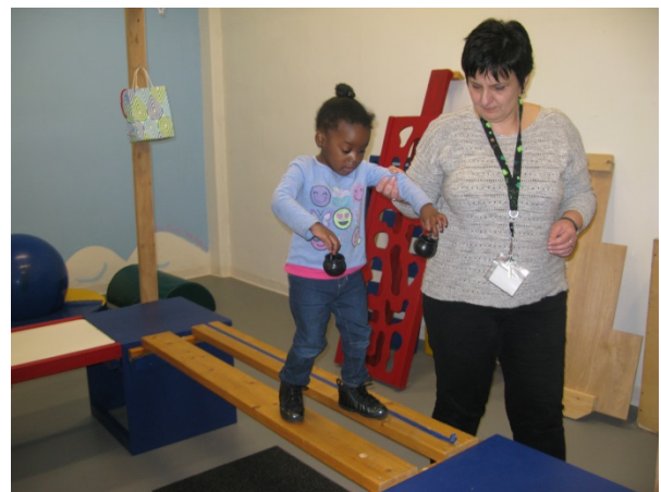
Student walks along boards in the activity room