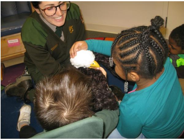
Students touch a toy bald eagle