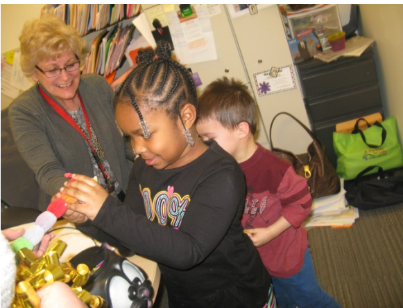
Students find the pot of gold