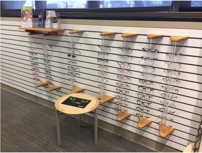
Frame displays with children's frames