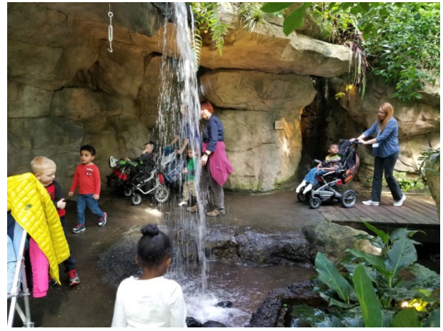
Students on the pathway under the waterfall