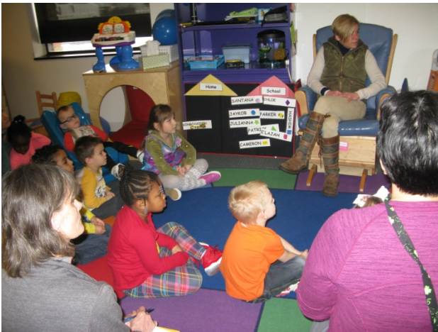
Students pay attention to a horseback riding video