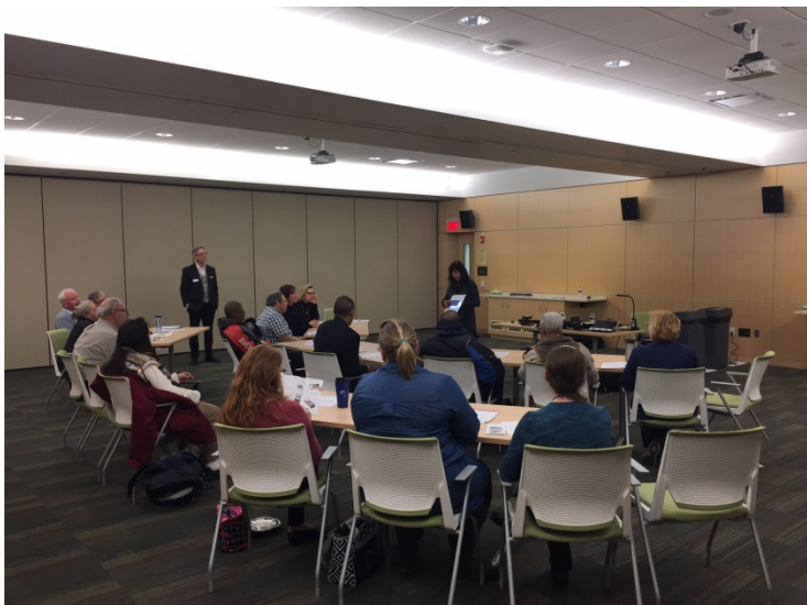
Eschenback representative presents on various devices