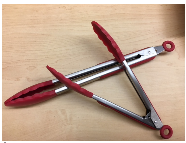
Silicone tong set

• The Silicone Tong Set is a must-have for any kitchen. Great for turning burgers or retrieving corn on the cob from the pot or platter, turning fried foods or just as salad tongs. Two sizes come in the set. The large tong is 14" and the small tong is 11". Both have silicone on the tips and the handles for hot items and have a lock to keep them closed and contained in the drawer or utensil jar. The Eyedea Shop's price is $20.00 for the pair.