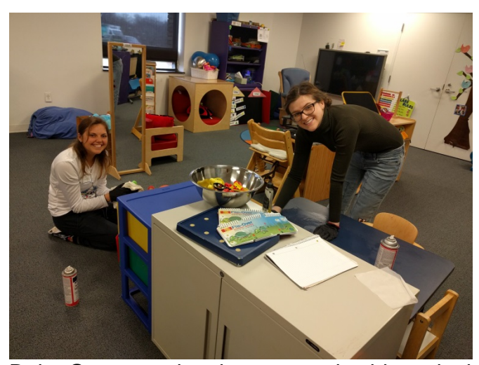
Delta Gammas cleaning toys and cabinets in the preschool