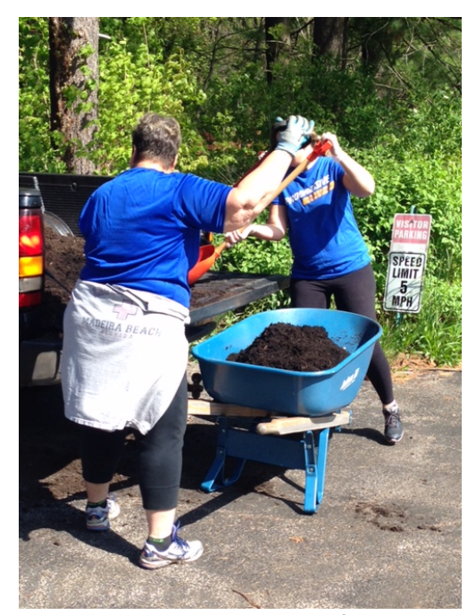
Volunteers move stacks of shingles via flatbed Volunteers shovel mulch from a truck to wheelbarrow