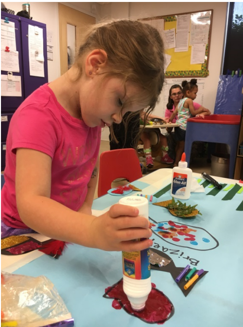
Youngster finishes her art craft