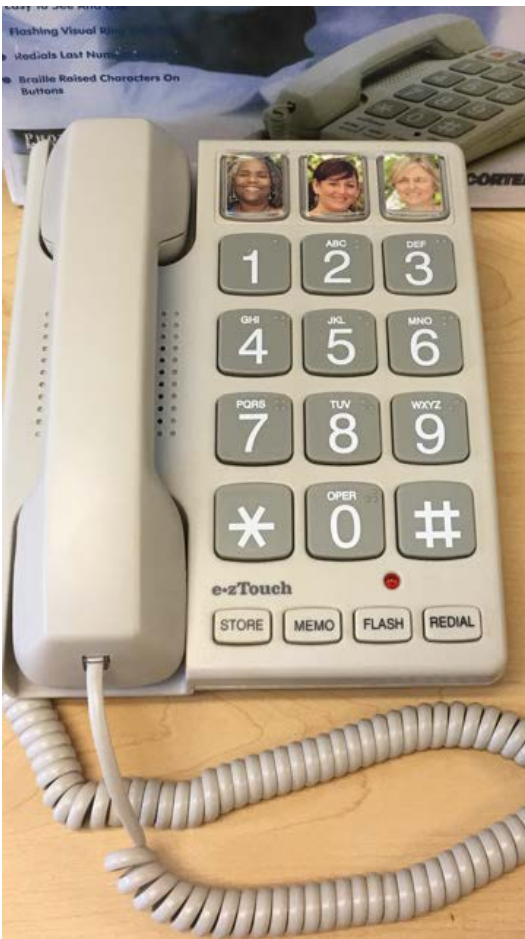
Image of big button braille telephone