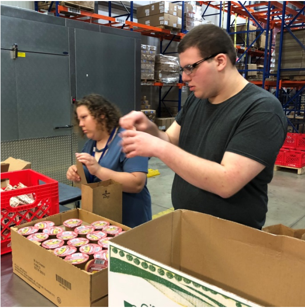
Workers pack boxes at the Food Bank