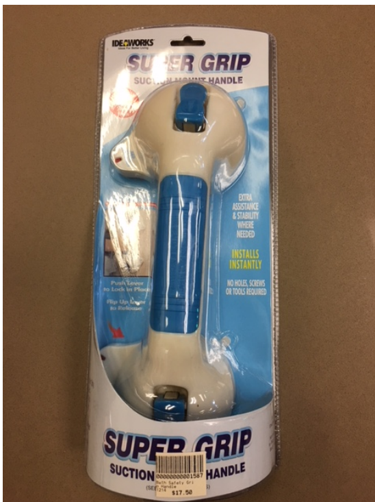
Image of the super grip suction handle