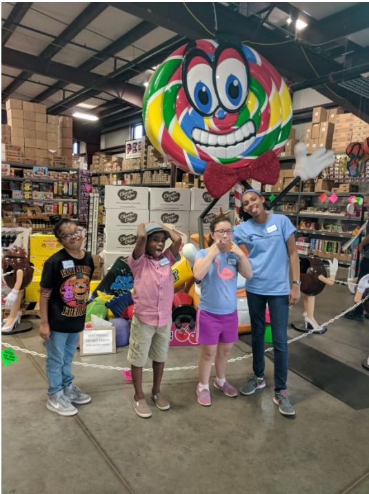
BLAST attendees in the candy warehouse

Candy Warehouse. Of course, everyone shopped and took home some sweet treats!