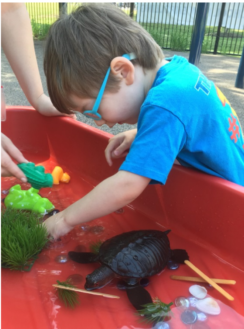
Young guy plays in the water tray