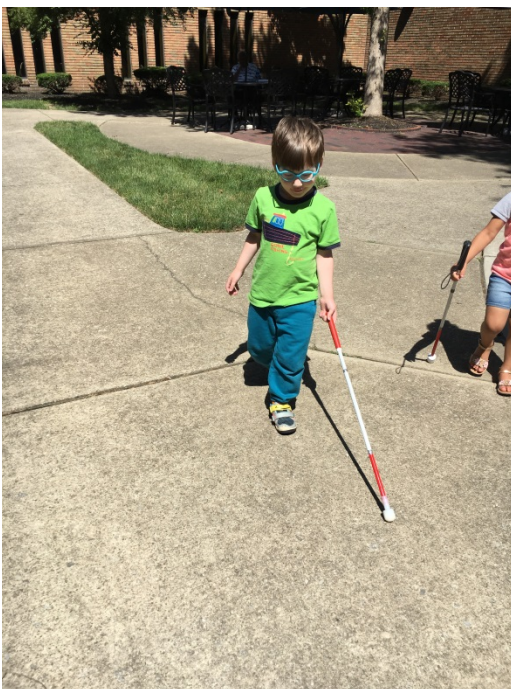
A little guy practices his cane usage in the courtyard