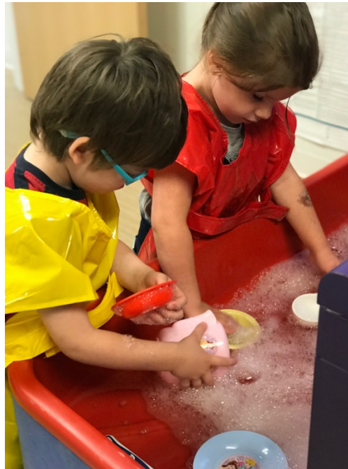
Youngsters play with soap, water and dishes