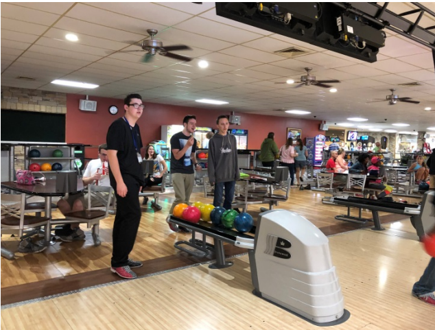
Group of guys at the bowling alley