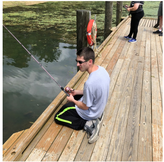
Participant enjoys fishing from the dock