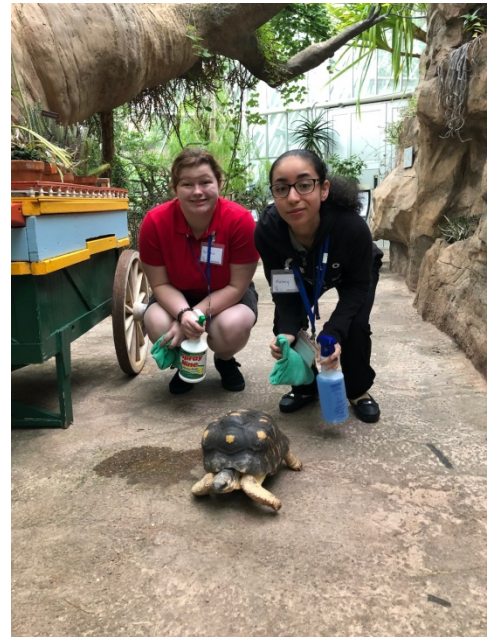
Workers at the zoo with a turtle