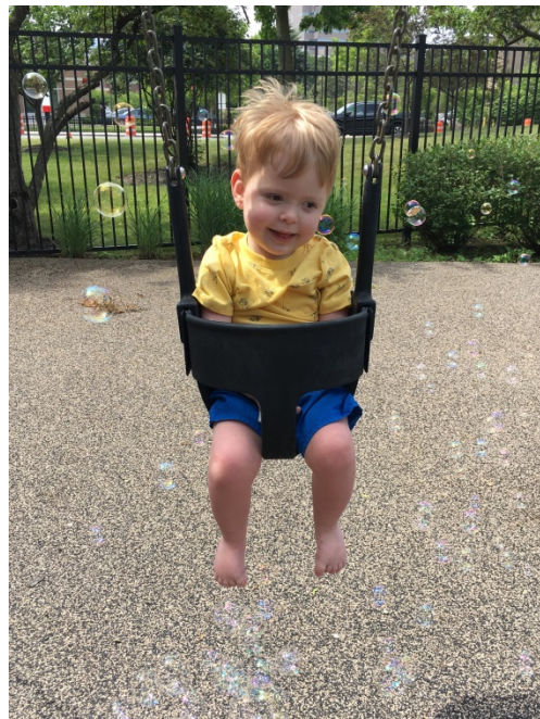
Little boy enjoys the swing and bubbles