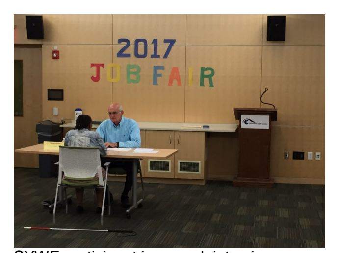
SYWE participant in a mock interview