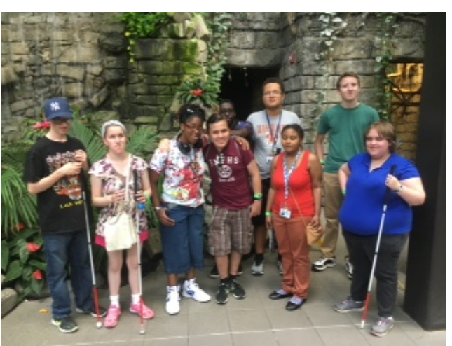
Program participants at the waterfall inside the zoo's rainforest