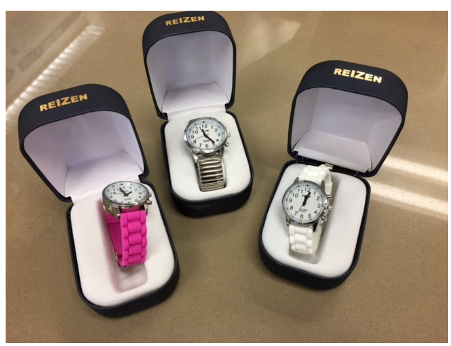
The Talking Tap Watch in pink, chrome and white bands

• The item of the week is the Talking Tap Watch. Just tap the face of the watch and it will speak the time. Hold down the face for three seconds and the watch will speak the time and it will speak the date. The face is white with black hands so people with low vision may be able to read the face as well. It also features an alarm to set a reminder about medication or a wake-up call. The ladies model is available in pink white or aqua. The men's version comes in chrome. The Eyedea Shop price is $65.00.