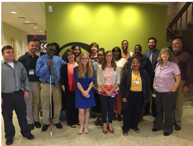
CSC team members with representatives from Ohio Department of Health and Ohio Department of Developmental Disabilities in the front lobby