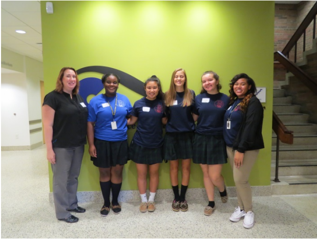
Beaumont School group in CSC lobby

in the lower level. The group moved inventory, did some cleaning, and helped with labeling to make the storage room more accessible. Thanks to the Beaumont crew for their initiative and organization!