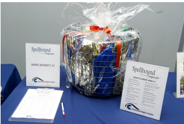
Wine basket in the silent auction