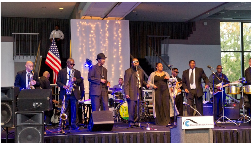
The Chosen Few Band performs