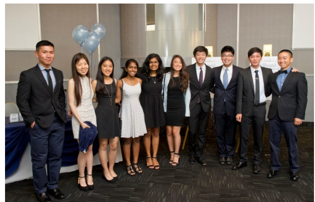
Students from Case for Sight