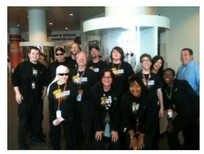
Rock n' Roll Hall work group