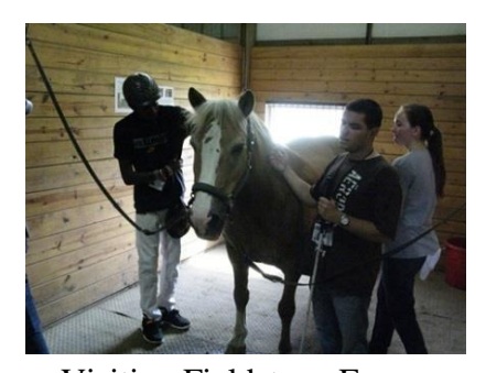
Visiting Fieldstone Farm