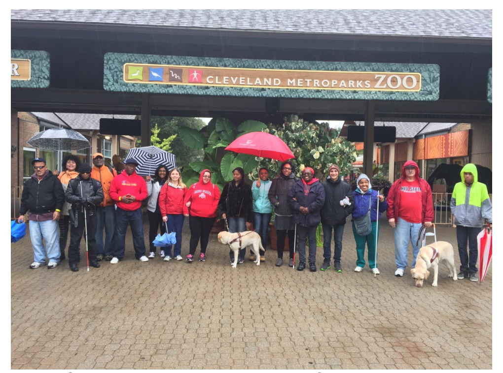
Walking Club participants at the entrance to Cleveland Metroparks Zoo