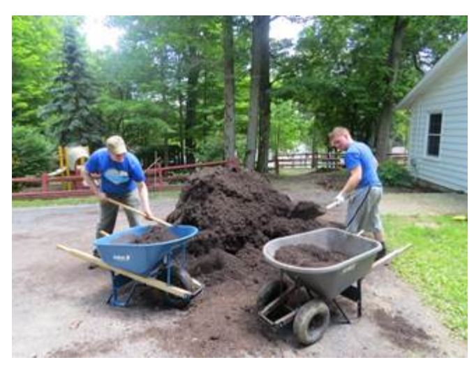
Volunteers load mulch onto wheelbarrows

• The Highbrook Lodge Committee met at camp on Thursday, June 4<sup>th</sup> to review programming, facilities and finances and discussed how committee members can be involved including helping with the Annual Highbrook Appeal, marketing the programs and helping promote "wish list" items.