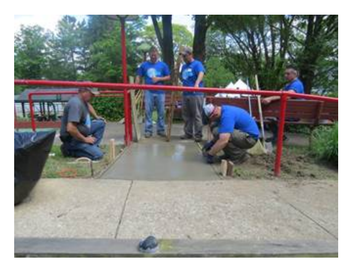
Volunteers measure the new concrete sidewalk