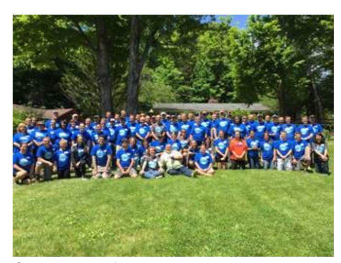
Group photo of Lubrizol volunteers