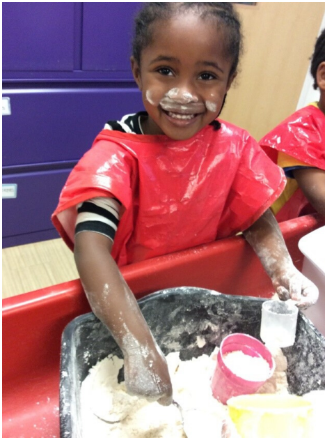
A preschool girl with flour on her nose and cheeks smiles as she plays with a bin of flour and measuring cups