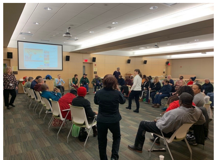
Instructors engage the group with chair dance moves and exercise