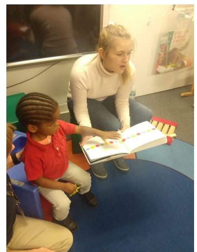
A preschool boy and volunteer read a tactile book together