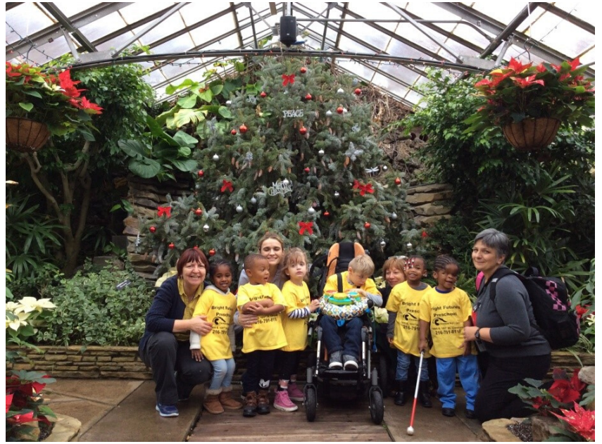
Group photo of students and teachers at the greenhouse

-A lively group gathered for the year's final Winners Club social event on Thursday as they welcomed teachers from The Dancing Wheels who engaged the group in a variety of dancing - including chair dance moves! The group enjoyed a delicious meal of salad, garlic bread, stuffed shells and chicken sandwiches. Thanks to all who attended and the staff members who took time to assist clients, work alongside one another and celebrate the season at CSC!