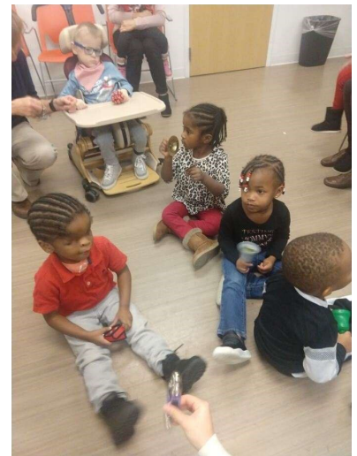
Preschoolers play with mini musical instruments during a song

-Students in Bright Futures Preschool enjoyed music time with the Braille Notes Choir at CSC on Wednesday, listening to a variety of holiday tunes and participating in some sing-a-longs. The preschoolers also spent time reading tactile books with a group of volunteers from John Carroll University. As the students prepare for Christmas and the holidays, they studied about how to make bread - reading books, looking at pictures, exploring flour, playing with bread dough and baking bread! They also enjoyed a field trip to the Rockefeller Greenhouse.