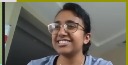
Elf waving (top left), Music volunteer (top right), Meditation leader (middle) and Sing it Out leaders (bottom).