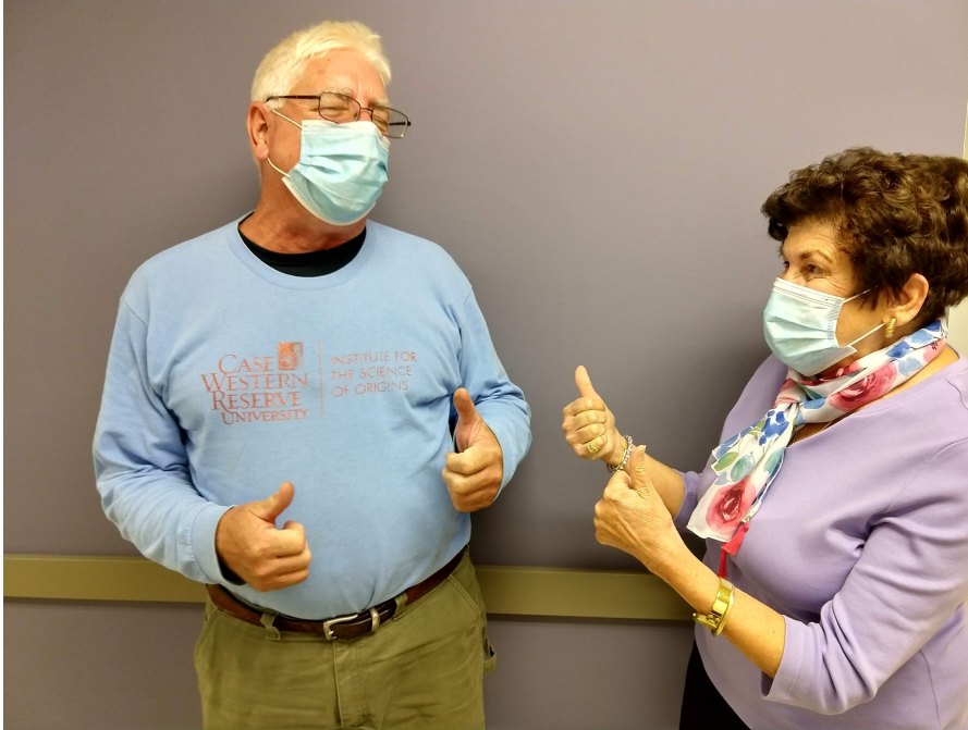
Radio Reading Volunteers

CSCN hosted 5,719 online radio sessions in 2020.