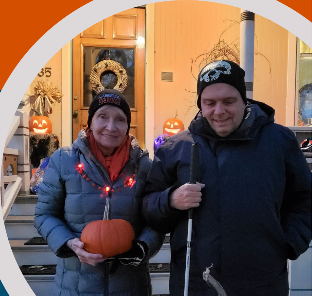
Recreation participant with pumpkin.