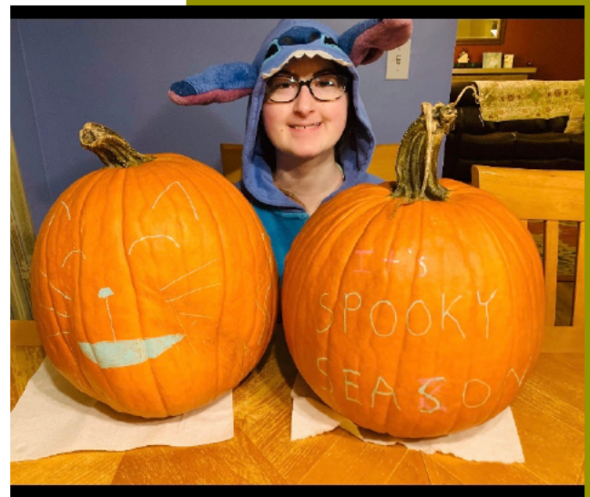
Reading Cube (top), University School Volunteers (left) and client smiling with pumpkins (right)