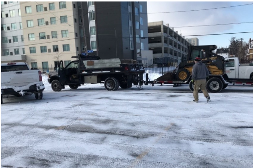
Image of a bobcat compact tractor with a front end loader filled with snow