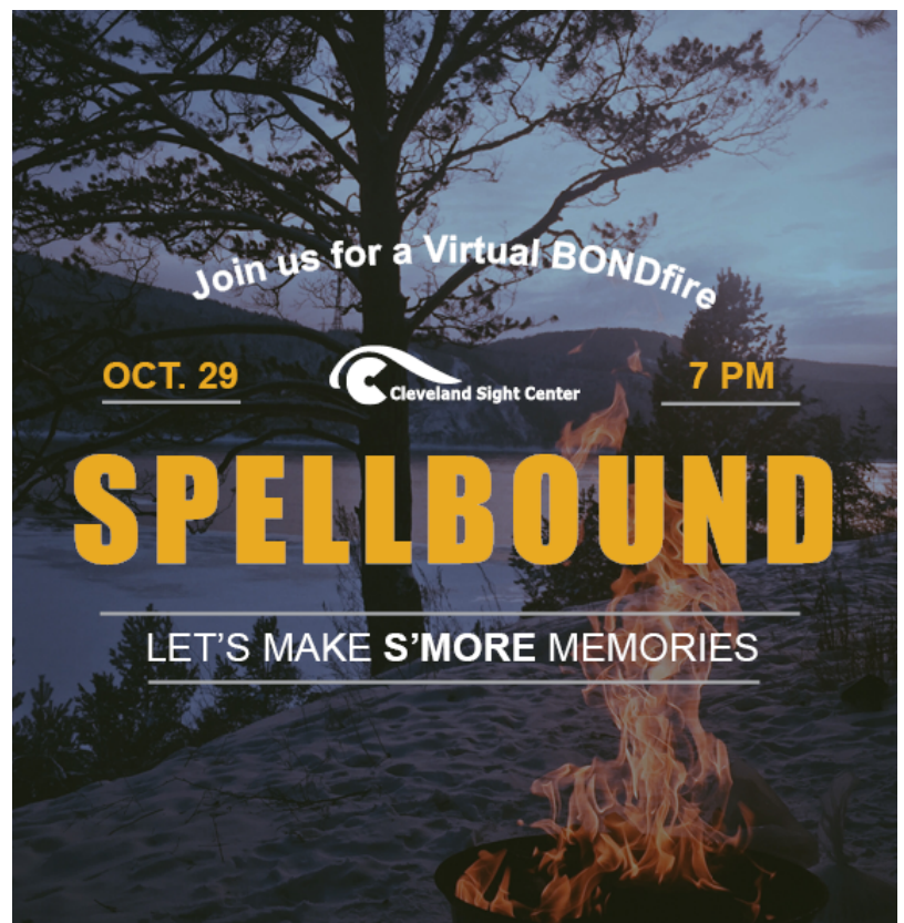
Image of Spellbound 2020 with a campfire on the beach next to a lake at sunset