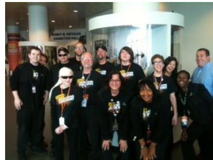
Rock n' Roll Hall work group