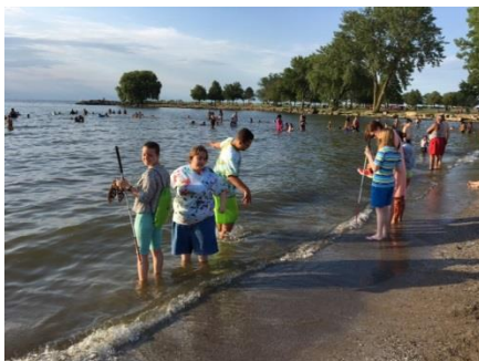
Visiting Edgewater Park

Recreation, socialization & mentoring activities