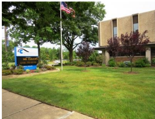
Cleveland Sight Center