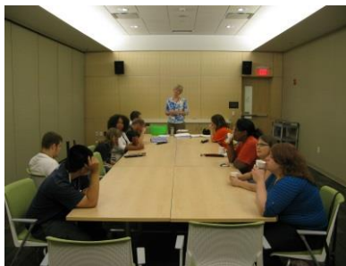
Group instruction – job seeking skills training