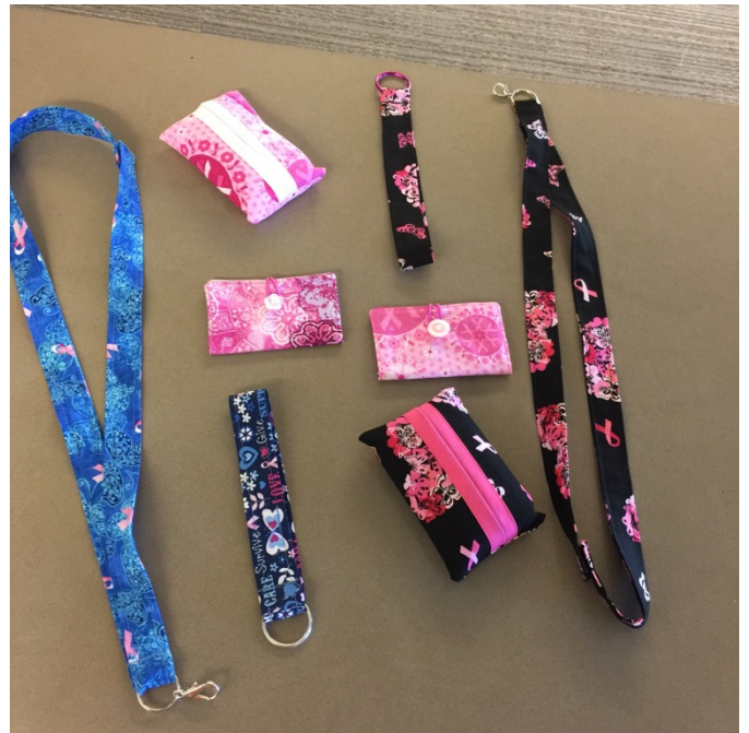
Items including keychains, key fobs, tissue holders and more!

• Also being featured in the Eyedea Shop are items to support breast cancer awareness, including lanyards, key fobs, tissue holders and business card holders. All items are under $5.00 and have been crafted by the hands of Sylvia Snyder. All proceeds from the sale of these items support CSC's Children & Young Adult Services.