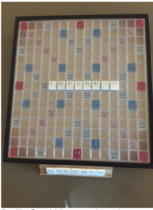
Braille Scrabble game board