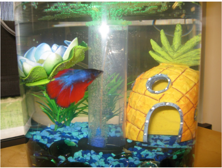
Swimmy the betta fish in his fish tank