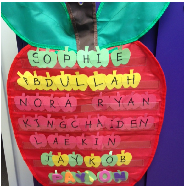
Student names on apples