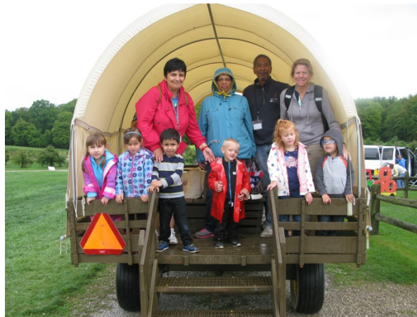
Preschoolers and staff on the wagon