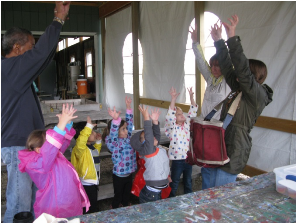
Preschoolers raise their hands