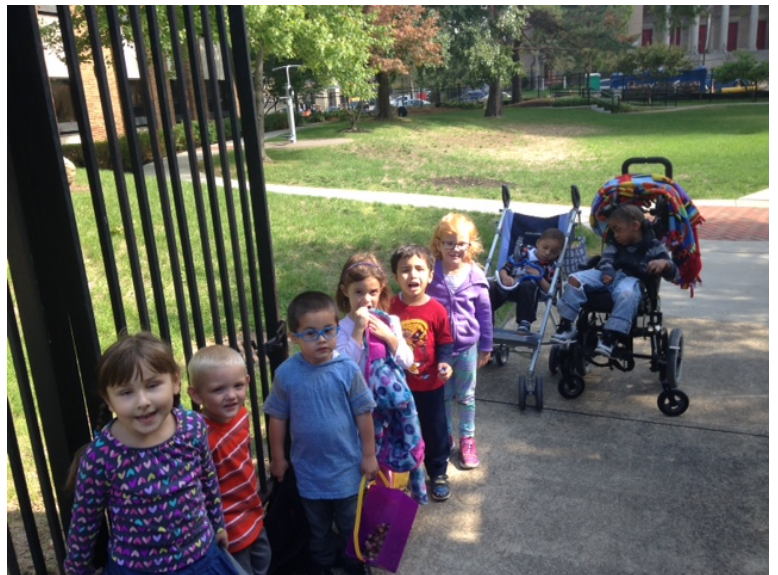
Students lined up in the Empowerment Park