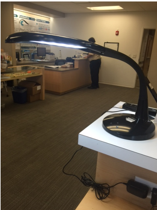
Stella Light on a counter top