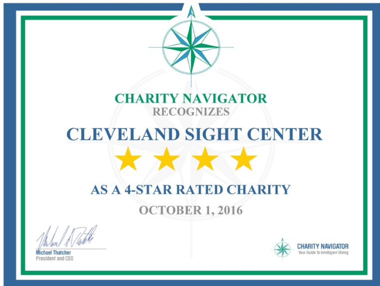
Charity Navigator's 4-Star certificate to CSC