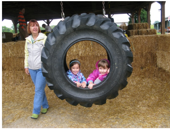
Two preschoolers in a large tire swing