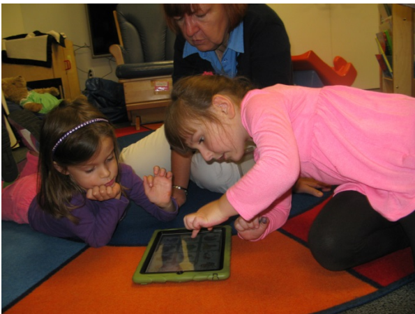
Preschoolers using an iPad