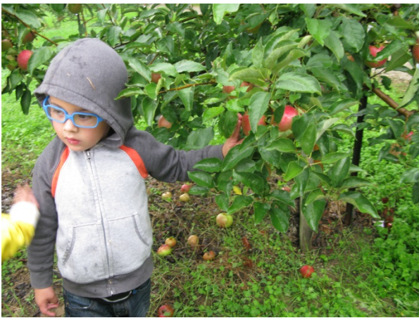
Preschooler picks an apple