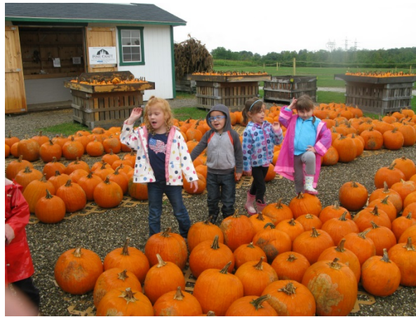
Youngsters among lots of pumpkins