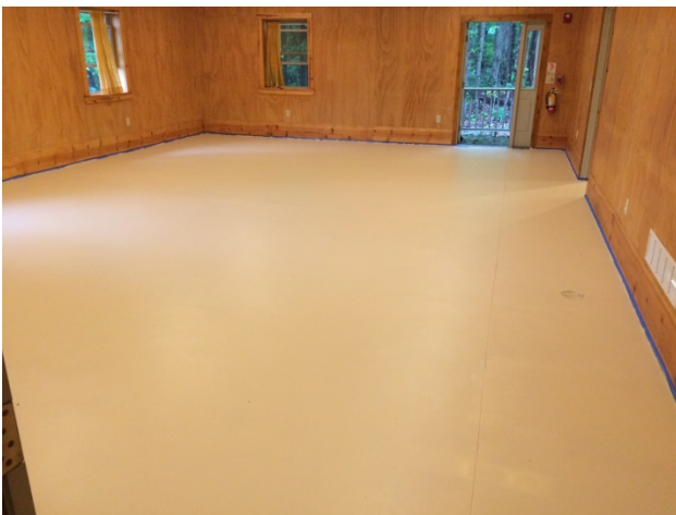
Floor of a room in Tall Timber