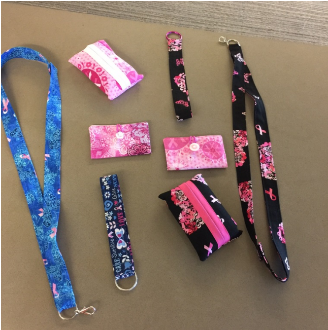
Items including keychains, key fobs, tissue holders and more!