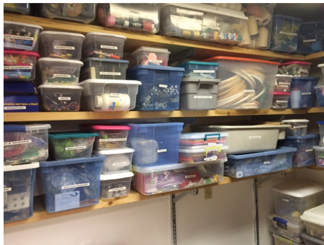
Storage bins neatly stacked on shelves