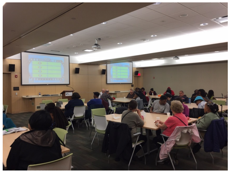
Winner's Club participants enjoy a game of Family Feud