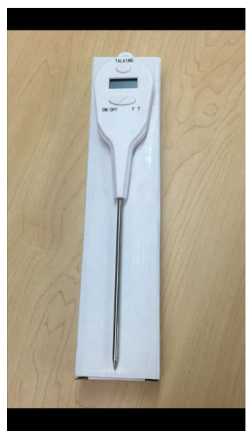
Talking meat thermometer white in color

featured product is a talking meat thermometer that is perfect for ensuring those delectable meats are cooked to the appropriate temperature. Easy to operate with just three buttons to press. The Eyedea Shop's price is $40.