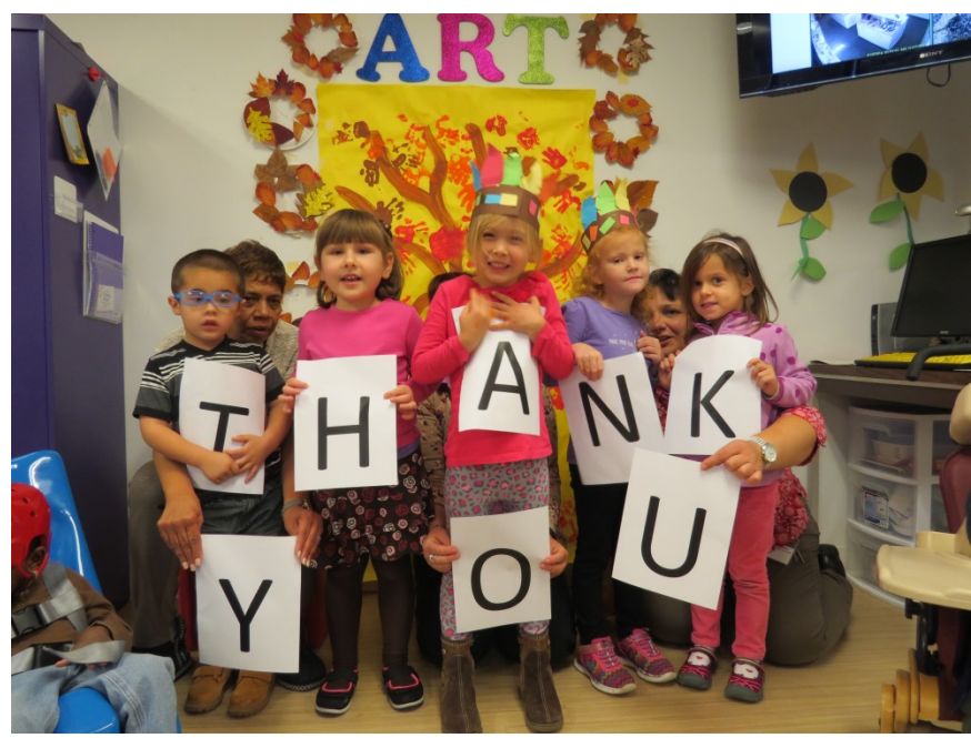
Preschoolers hold letters spelling Thank You

A very Happy Thanksgiving and THANK YOU to all CSC staff, Board Trustees, clients, volunteers and friends for your support during the 2016 year. Our agency would not be as unique, talented, vibrant and strong without your ongoing passion and commitment to our mission to empower people with vision loss to realize their full potential and to shape the community's vision of that potential.