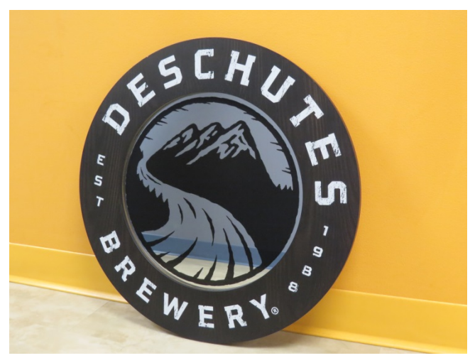
Mirror with mountains and Deschutes Brewery printed on it

-A mirror from Deschutes Brewery (Bend, Oregon) to complement any bar area, gathering space or Man Cave. Value is $100.