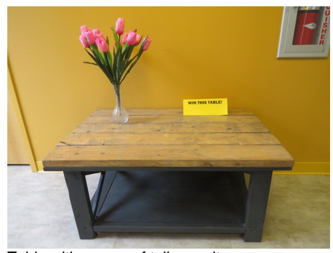
Table with a vase of tulips on it

-A one-of-a-kind handmade blanket/quilt measuring 58" x 42" crafted by Brenda Lammers, Brooke Lewis and Sylvia Snyder. A matching miniature dog comes with the blanket.