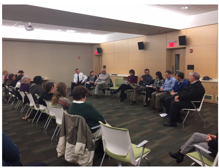
Representatives from Cleveland Metroparks discuss their accessibility plans

Representatives from Cleveland Metroparks visited Cleveland Sight Center on Wednesday, November 16<sup>th</sup> from 3:00 p.m. to 4:30 p.m. to present and receive feedback on their plans to make the Metroparks more accessible. Thanks to all staff and clients who participated in the session.