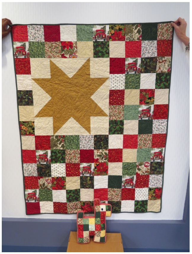
Blanket with gold star and colored squares with matching miniature dog

-A mirror from Deschutes Brewery (Bend, Oregon) to complement any bar area, gathering space or Man Cave. Value is $100.