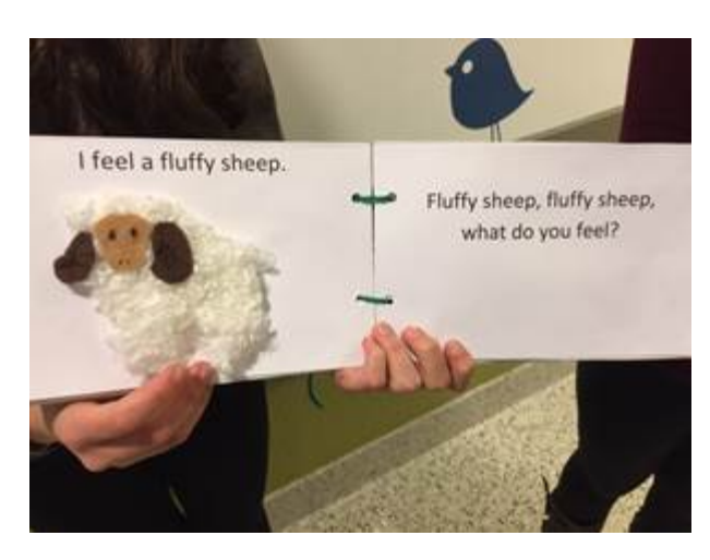
Close up of a fluffy sheep