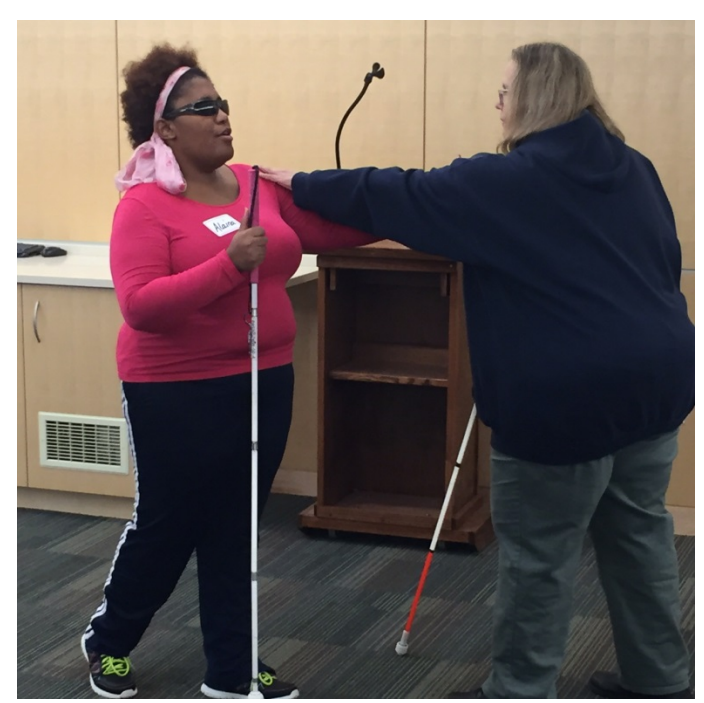
Participants demonstrate technique