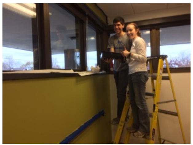
Volunteers on a ladder paint the Recreation Room

A group of volunteers from Gesu Parish completed activities at CSC on Saturday, December 3<sup>rd</sup> that included washing, taping and painting the Recreation Room and first floor hallways and moving a large quantity of furniture from the Residence Center. The group was very interested in learning more about CSC and was given a tour by Scott Malone.