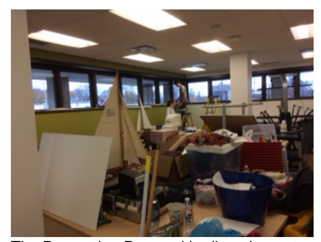
The Recreation Room with all equipment