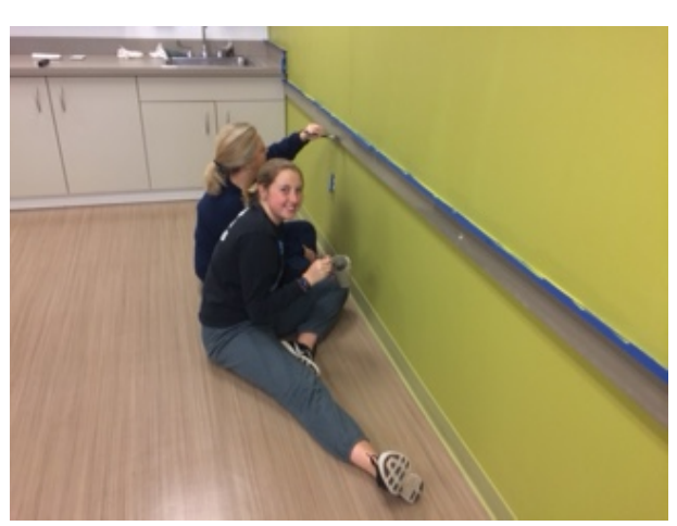
Volunteers paint the lower half of the wall