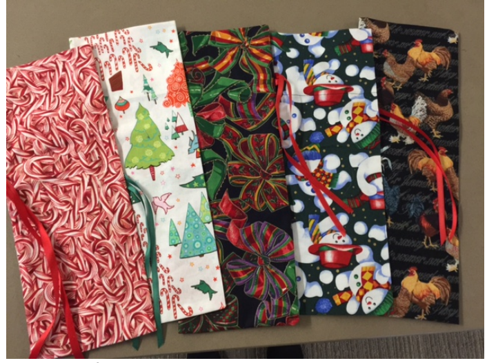
Variety of wine bags in holiday patterns and prints

Looking for a beautiful way to present your gift of a bottle of wine this holiday season? The Eyedea Shop is featuring beautiful homemade wine bottle/gift bags for the holidays crafted by Sylvia Snyder. There are several patterns to choose from and the bags are made of cloth with a ribbon pull tie. Only $3.00 each or 2 for $5.00, come see the selection in the Eyedea Shop while they last!