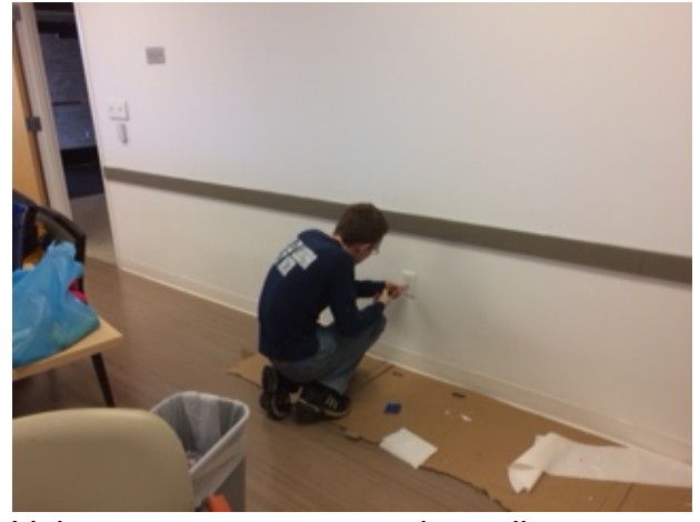
Volunteer removes an outlet wall cover moved to the middle of the room