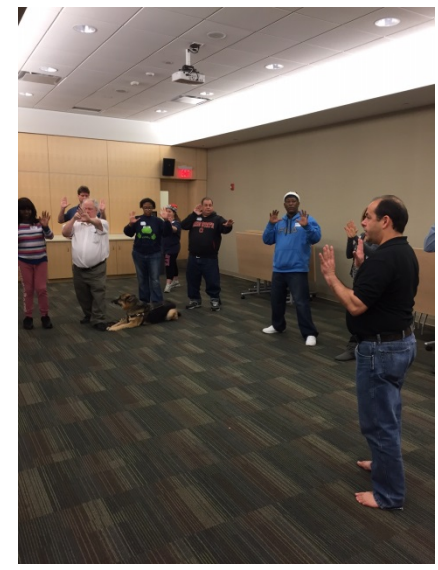
Participants demonstrate ready position