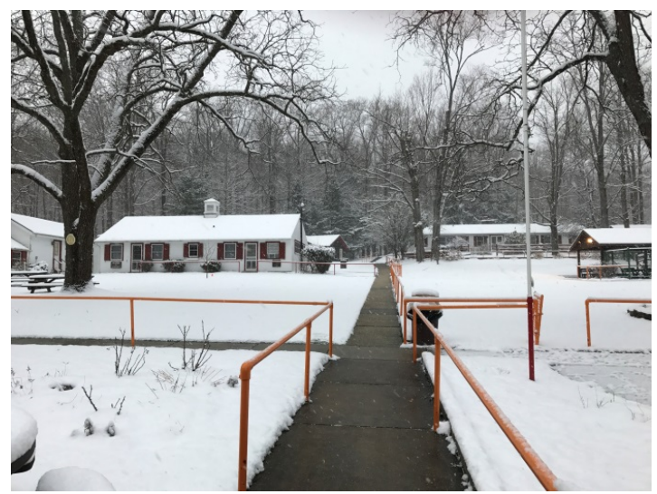
The grounds of Highbrook Lodge covered in snow

Winter Weekend at Highbrook Lodge takes place the weekend of February 23<sup>rd</sup> – 25<sup>th</sup>. Campers will arrive to Highbrook Lodge at 6:00 p.m. Friday evening and depart at noon on Sunday. Cost of the weekend is $65/camper. Transportation to/from CSC is provided for an additional $15/camper. To register please call the Camp Department (216-791-8118).