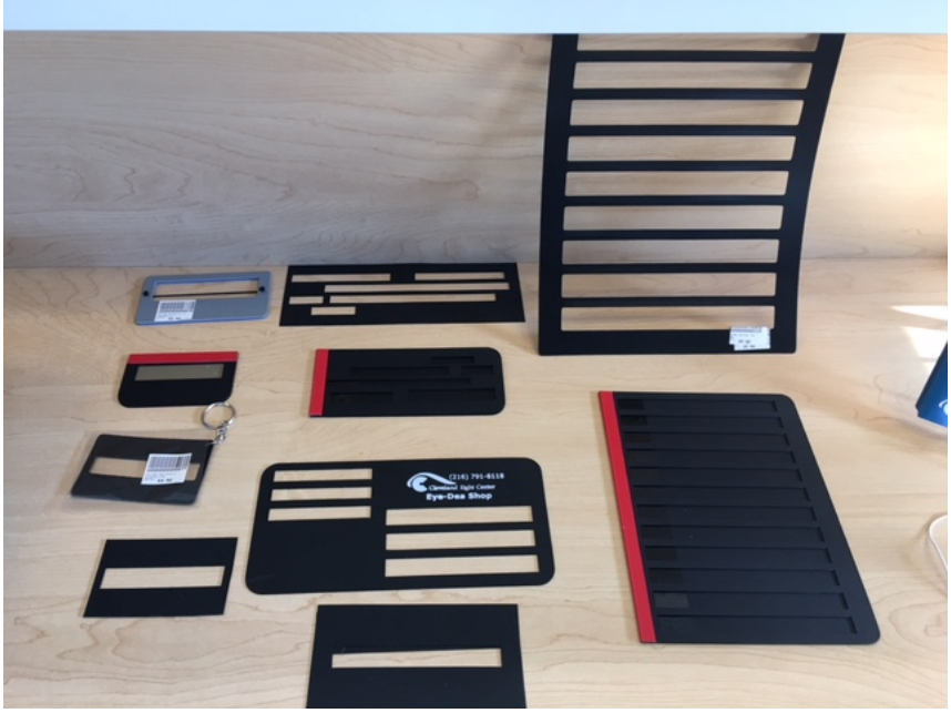
All kinds of writing guides

• Can't make it to the Eyedea Shop at CSC? Then check out the product offerings online at <u>www.eyedeashop.com</u> and purchase items from the comfort of wherever you may be!