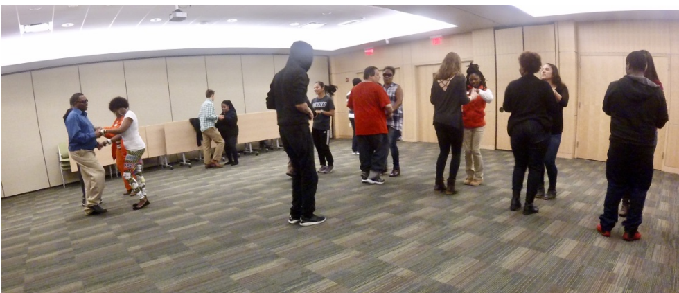
Participants practice their merengue moves