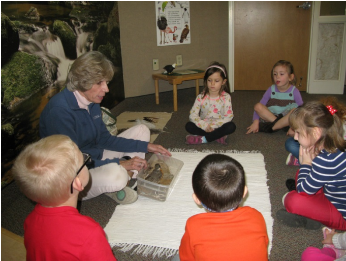
Students learn about the nest