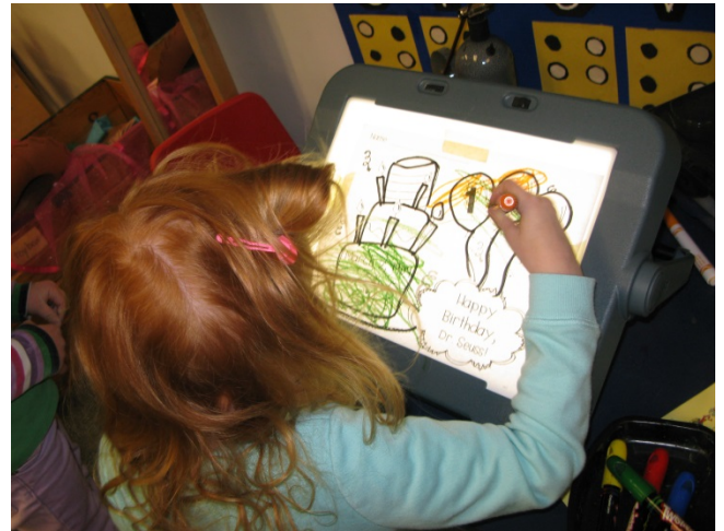
Student creates a birthday card