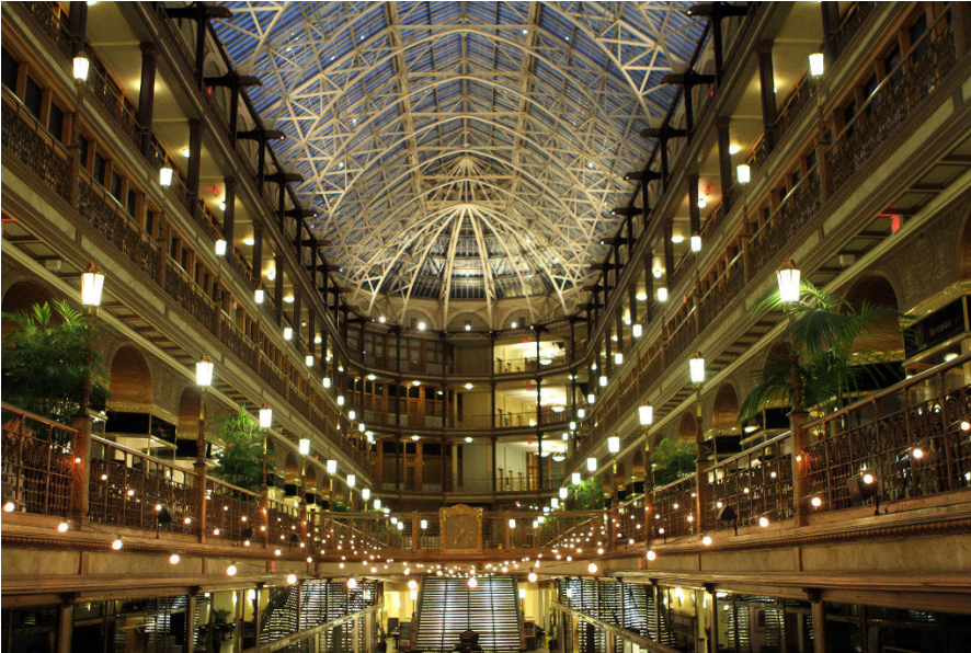
Image of inside the Arcade