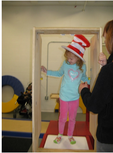
Student participates in the obstacle course