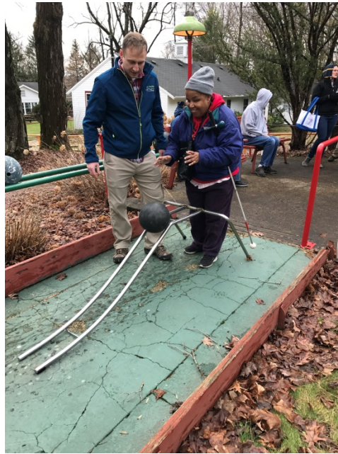
A camper enjoys bowling with the assist of a staff member