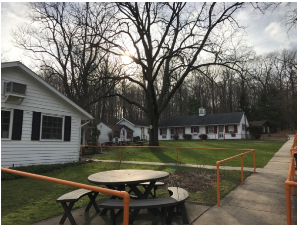
Friday at Highbrook Lodge: 72 degrees with sun