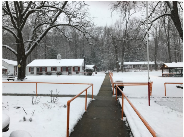
Sunday at Highbrook Lodge: 27 with snow