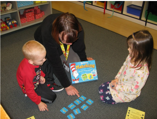
Students play the card matching game