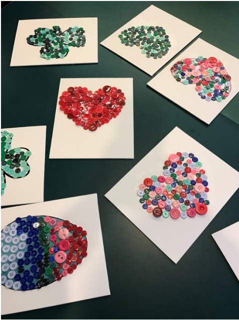
Tactile arts including hearts and shamrocks member