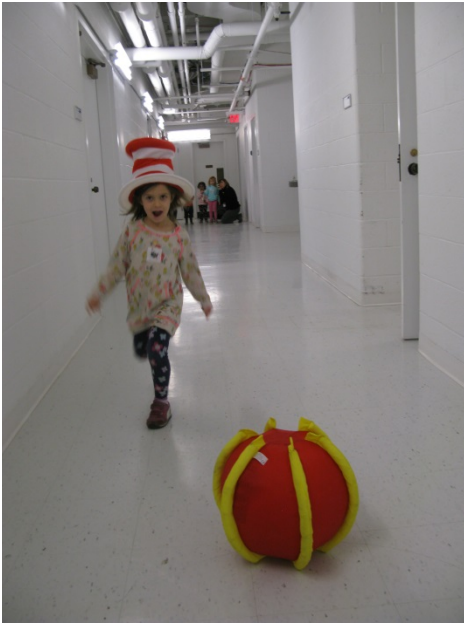
Youngster races in the hat