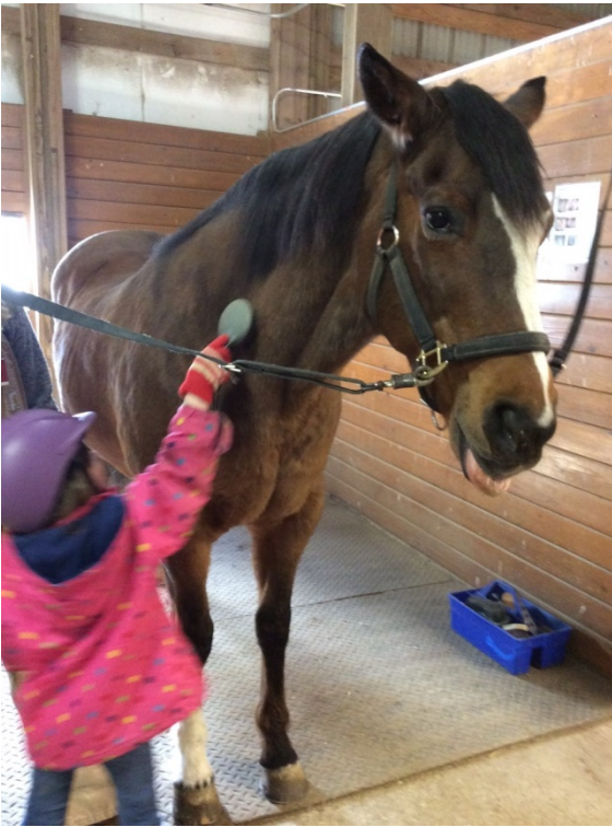
A preschool student brushes a horse inside the stable