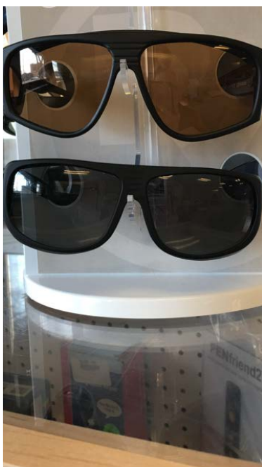
More sunglasses on display – brown lenses and black lenses