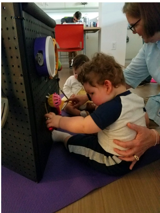
A youngster plays with a sensory board