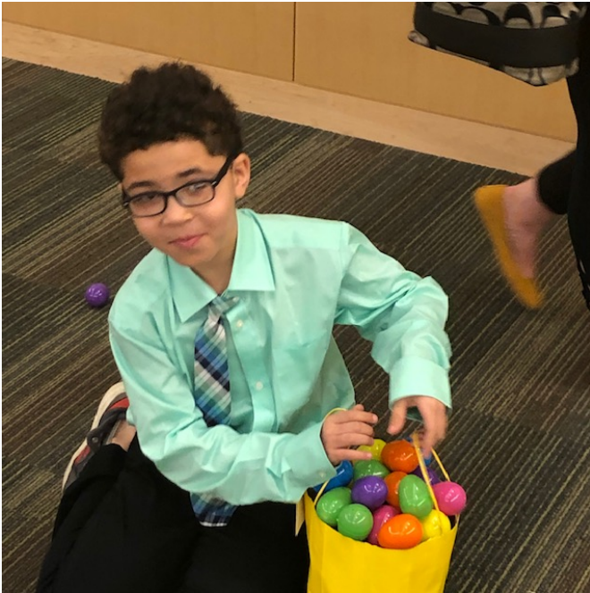
A boy smiles as he holds a bag filled with treat-filled plastic eggs

-Students in Bright Futures Preschool have begun their horseback riding lessons and enjoyed a visit and story reading from rangers from the Cuyahoga Valley National Park.