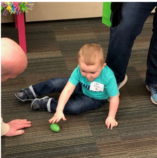
A little one reaches for a green plastic egg