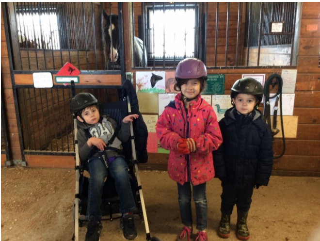
Preschool students inside the stables at Fieldstone Farms

-Students in Bright Futures Preschool have begun their horseback riding lessons and enjoyed a visit and story reading from rangers from the Cuyahoga Valley National Park.