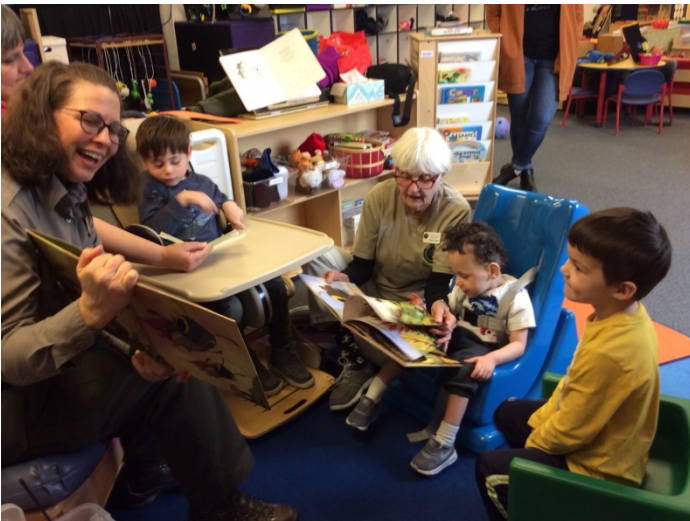
Preschool students listen to the rangers read a story

-The Volunteer Appreciation Dinner will be held at CSC on Thursday, April 25 th . The event will be from 5:30 p.m. – 7:30 p.m. and doors will open at 5:00 p.m. Invite or encourage volunteers you work with to attend CSC's "Snacks and Facts" sessions, where attendees can grab a snack to meet other CSC volunteers and staff, try out low vision tools and complete a task wearing low vision simulators.