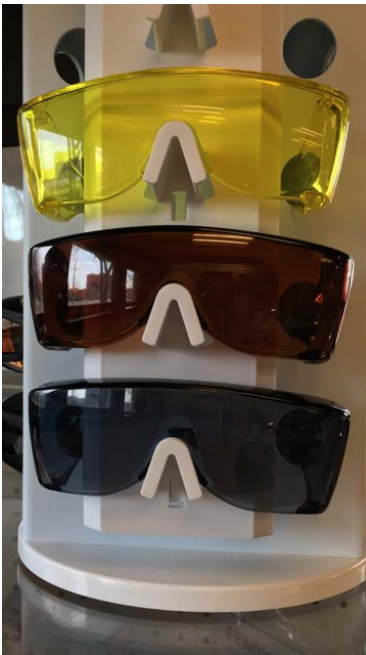
Image of various sunglasses on display in yellow, brown and black

-It's finally coming...spring is here and it's getting warmer. Before we know it, summer will be here and the sun will be out more than not! Get a new pair of sunglasses at the Eyedeas Shop. Please don't "squint" – it can cause wrinkles and interferes with your field of vision. The Eyedeas Shop offers polarized sunglasses to help with the glare and glasses that fit over prescription glasses as well. Choose from different colored lenses and many different styles. Price start at $18.00 so stop on in and check out some new shades!