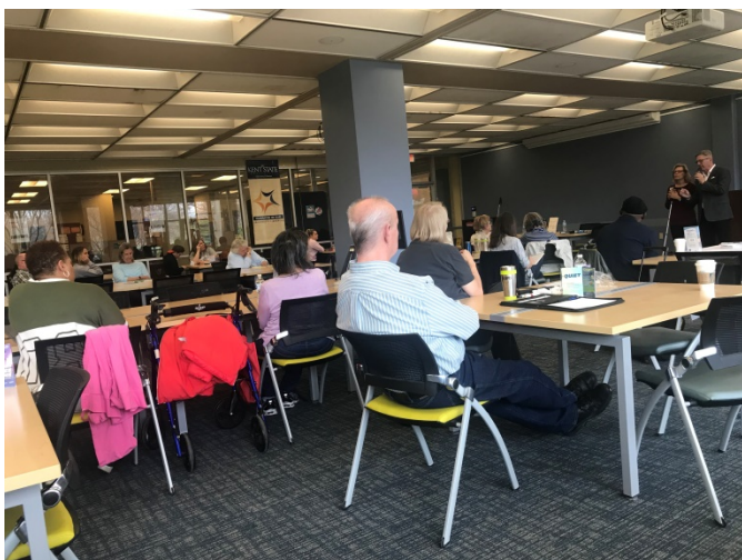
Audience members at a recent Kent State University event listen to the CSC message