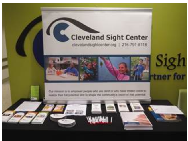
CSC's information table sporting a new tabletop banner and agency collateral