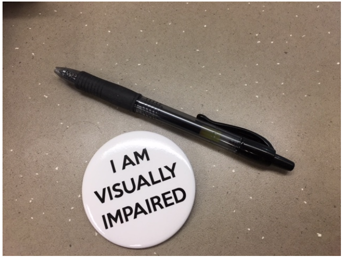
White button with black text "I AM VISUALLY IMPAIRED"

airports, while shopping or running errands, or just when riding public transportation. The price is $1.00.