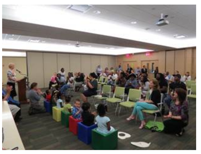
A full Clyde E. Williams, Jr. Auditorium enjoys the

Another round of congrats to the preschoolers as they successfully completed their riding program at Fieldstone Farms.