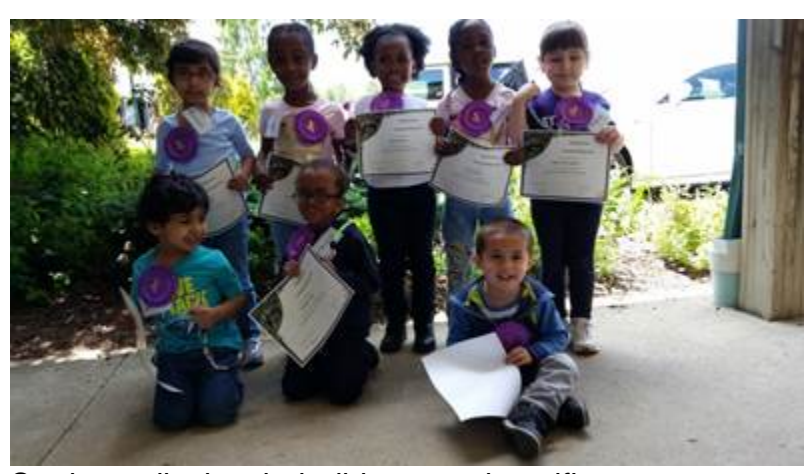
Students display their ribbons and certificates