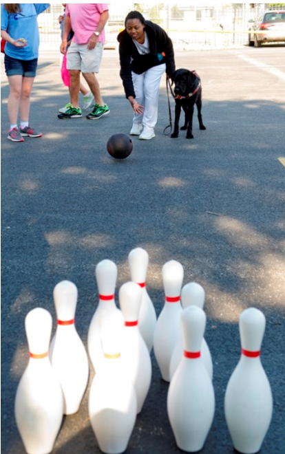
Participant tries the bowling activity