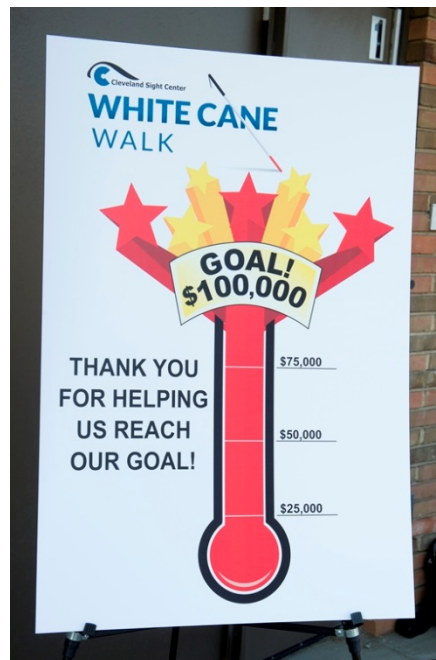
Sign indicating the $100,000 goal has been reached