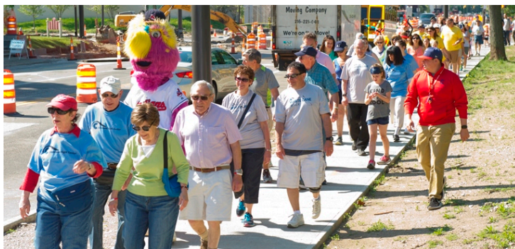
Walkers head down the Chester Avenue sidewalk