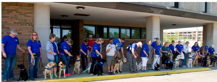
Puppy raisers and dogs lined up for the start of the walk