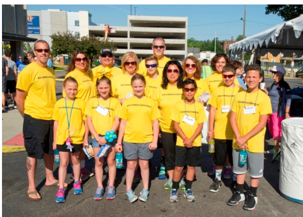
A team of walkers in yellow shirts walk