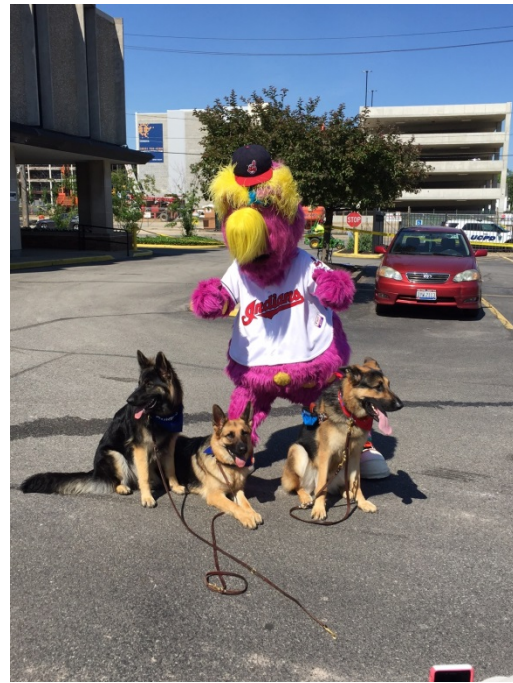
Slider with three puppies