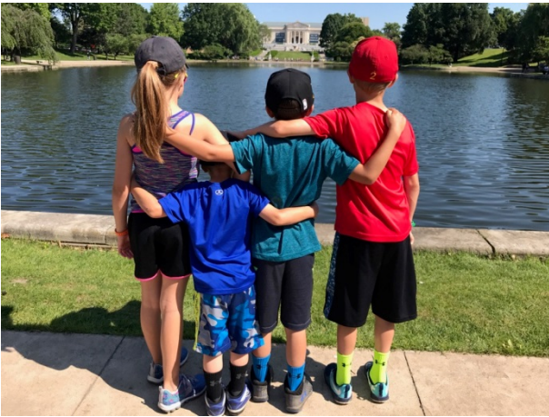
Youngsters in front of the lagoon stop for a photo