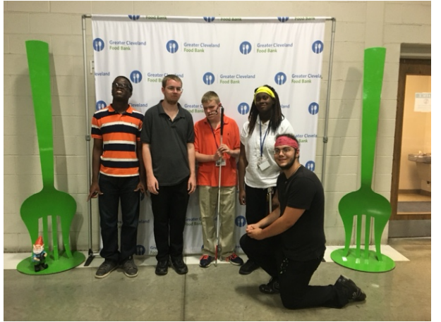
Group photo in front of Food Bank large forks SYWE participants wade in Lake Erie

SYWE participants pack boxes of food at the Greater Cleveland Food Bank