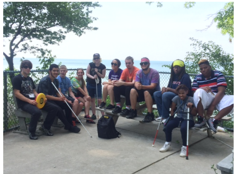
Group photo on a patio overlooking Lake Erie