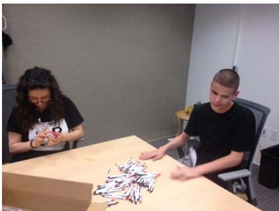
Students count and sort pens