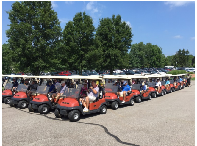
Golfers and carts lined up and ready to go