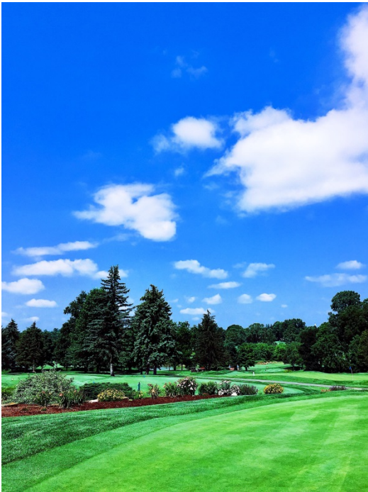
Green fairway under blue skies