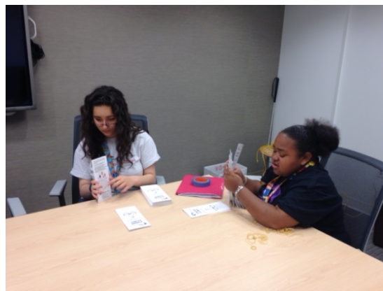
Students count and sort CSC brochures