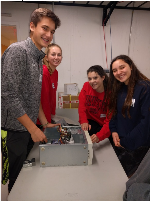
Students work on the computer equipment recycling project