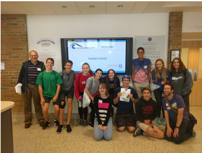
Group shot of Hawken students in the lobby