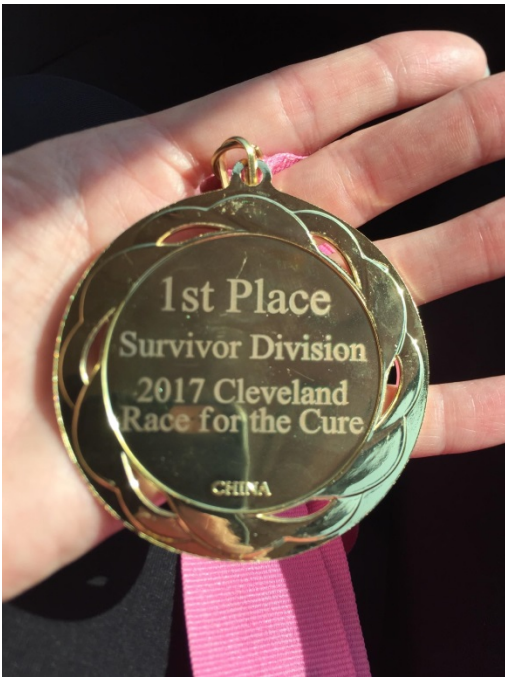
Image of 1 st Place gold medal