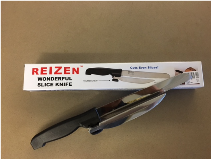
Reizen's Wonderful Slice Knife

eight-inch long serrated blade. The knife works best for right-handed chefs and recommended it be hand washed as needed. The price is $30.00.