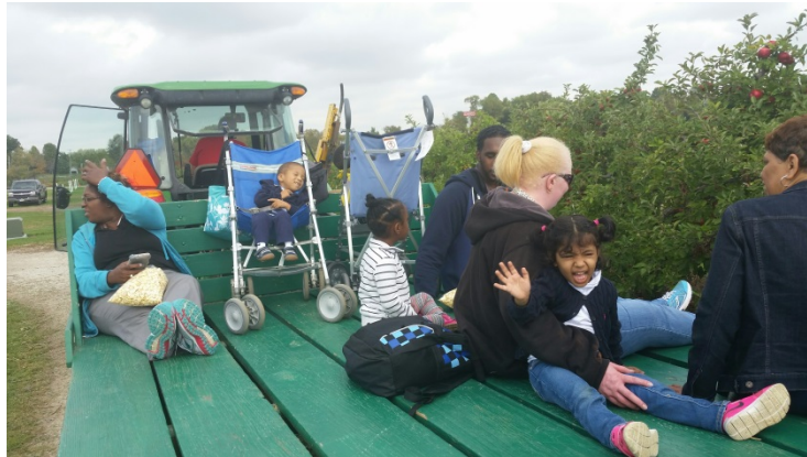
Bright Futures Preschoolers enjoy a tractor ride