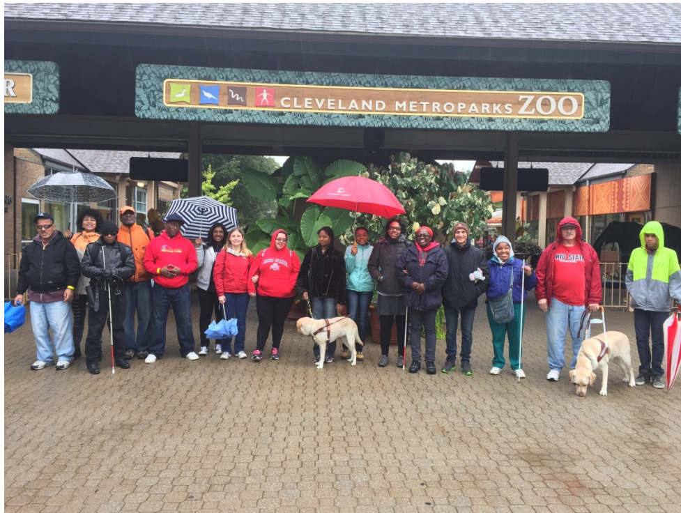
Walking Club participants at the entrance to Cleveland Metroparks Zoo