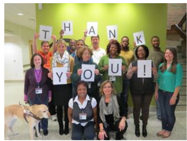
CSC staff members hold letters spelling "THANK YOU!"

A very happy Thanksgiving and thank you to all CSC staff, Board of Trustees, clients, volunteers, and friends for your support during the 2015 year. Our agency would not be as unique, talented and strong without your continued passion and commitment to our mission to empower people with vision loss to realize their full potential and to shape the community's vision of that potential.