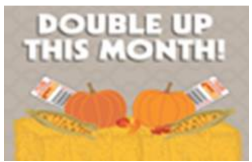
Labels for education "Double Up This Month" graphics