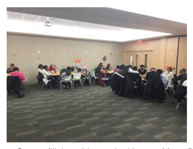
Guests fill the tables at the Harvest Moon Dance

• Holiday at Highbrook is Friday, December 11<sup>th</sup>...come experience all the wonderful outdoor offerings of Highbrook Lodge and surrounding areas in December! The group will depart CSC at 9:00am and head to the Marc's store in Chardon for some holiday shopping. Then it is off to Highbrook Lodge for lunch, a winter hike, holiday-themed arts and crafts, and songs around the campfire. Campers will return to CSC by 4:00pm. The cost is $20 per participant, which includes transportation. To register, contact Tamara Flowers (216-791-8118) by Friday, December 4<sup>th</sup>. All campers must register AND pay the fee before December 4<sup>th</sup>.