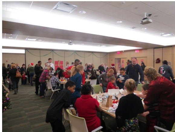
A full Clyde E. Williams, Jr. Auditorium