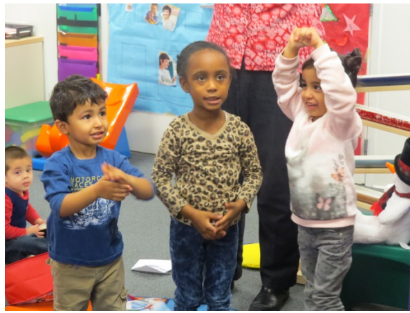
Preschoolers make hand gestures as part of a song