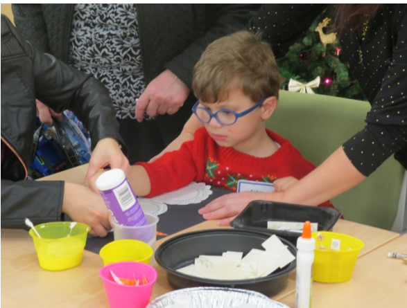
A youngster enjoys making crafts