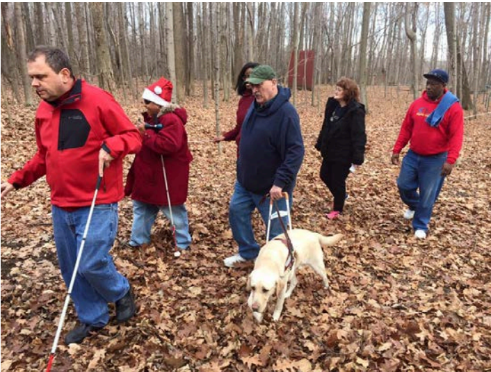
Campers enjoy a hike on the trails at Highbrook Lodge