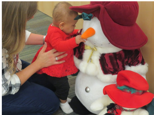
A baby explores a stuffed snowman