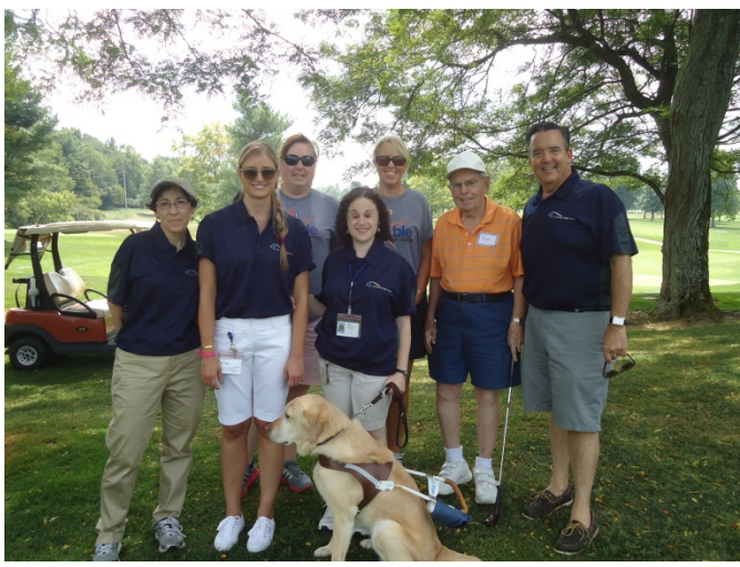
CSC staff members with Westfield reps on hole #8