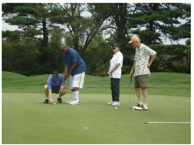
folded Golf Program participants line up a putt