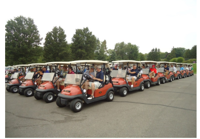
Golfers in their golf carts ready to head to the holes