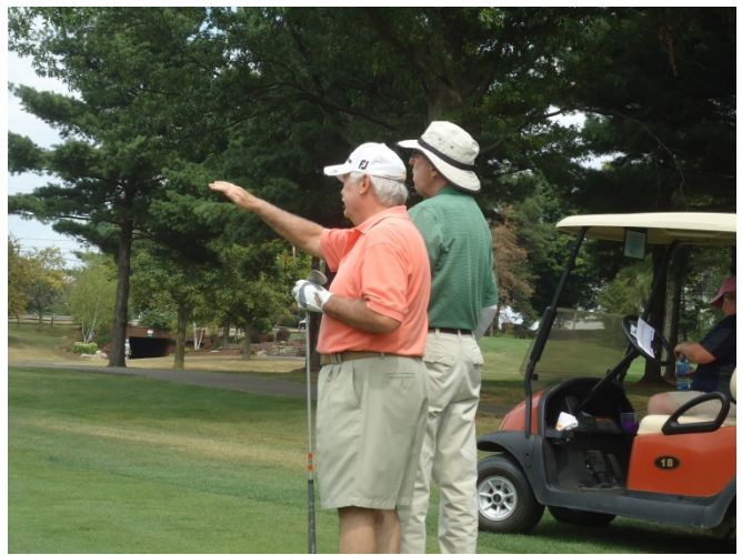
Golf program participant and coach line up the shot